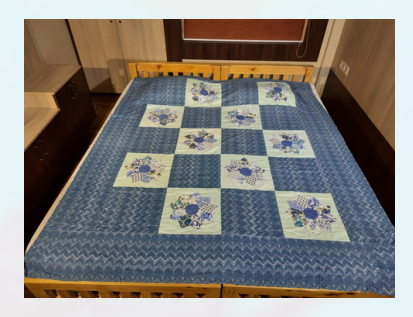
Sangam Designs: A women empowered start-up which employs differently abled girls and transforms waste cloth to usable utility.