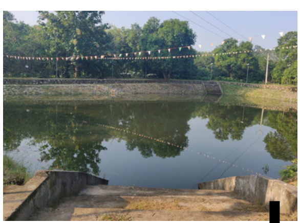
Natural Pit being used for Rain Water Harvesting