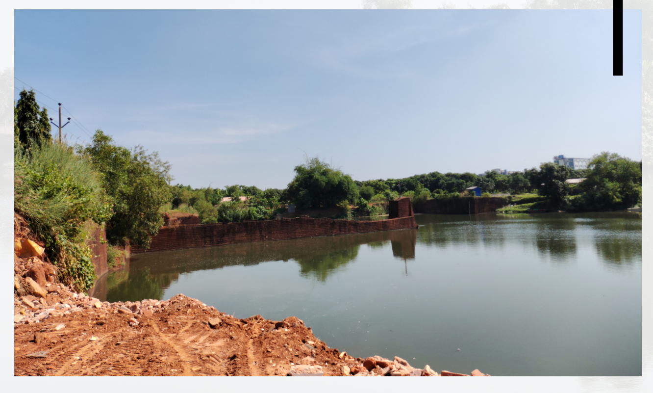
Pits made by illegal mining activity which is transformed for waste water treatment and RWH