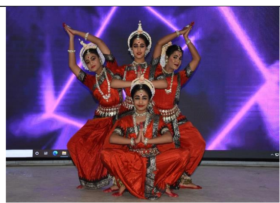
Odissi Dance Performance by Centurion Public School Students after Day-I Session