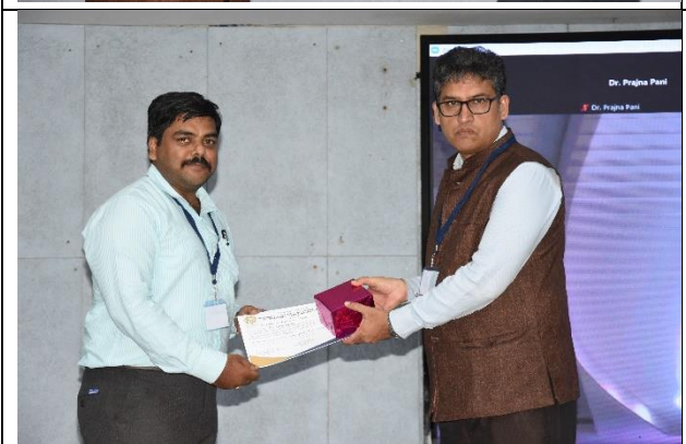
Steering Committee members and Convenor being felicitated