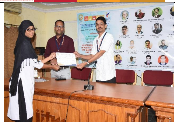
Participant Presenting a Paper and receiving participation certificate