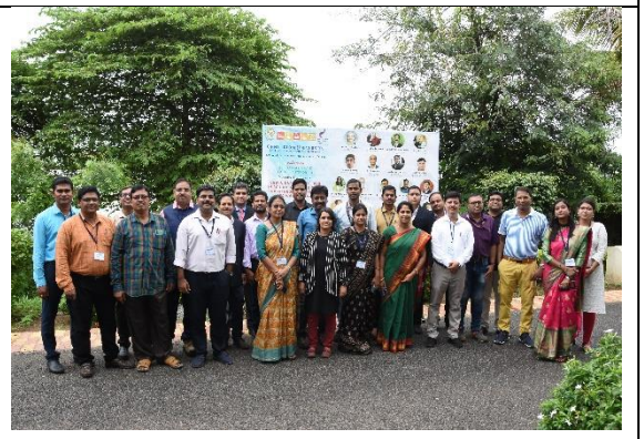
The School of Management Team