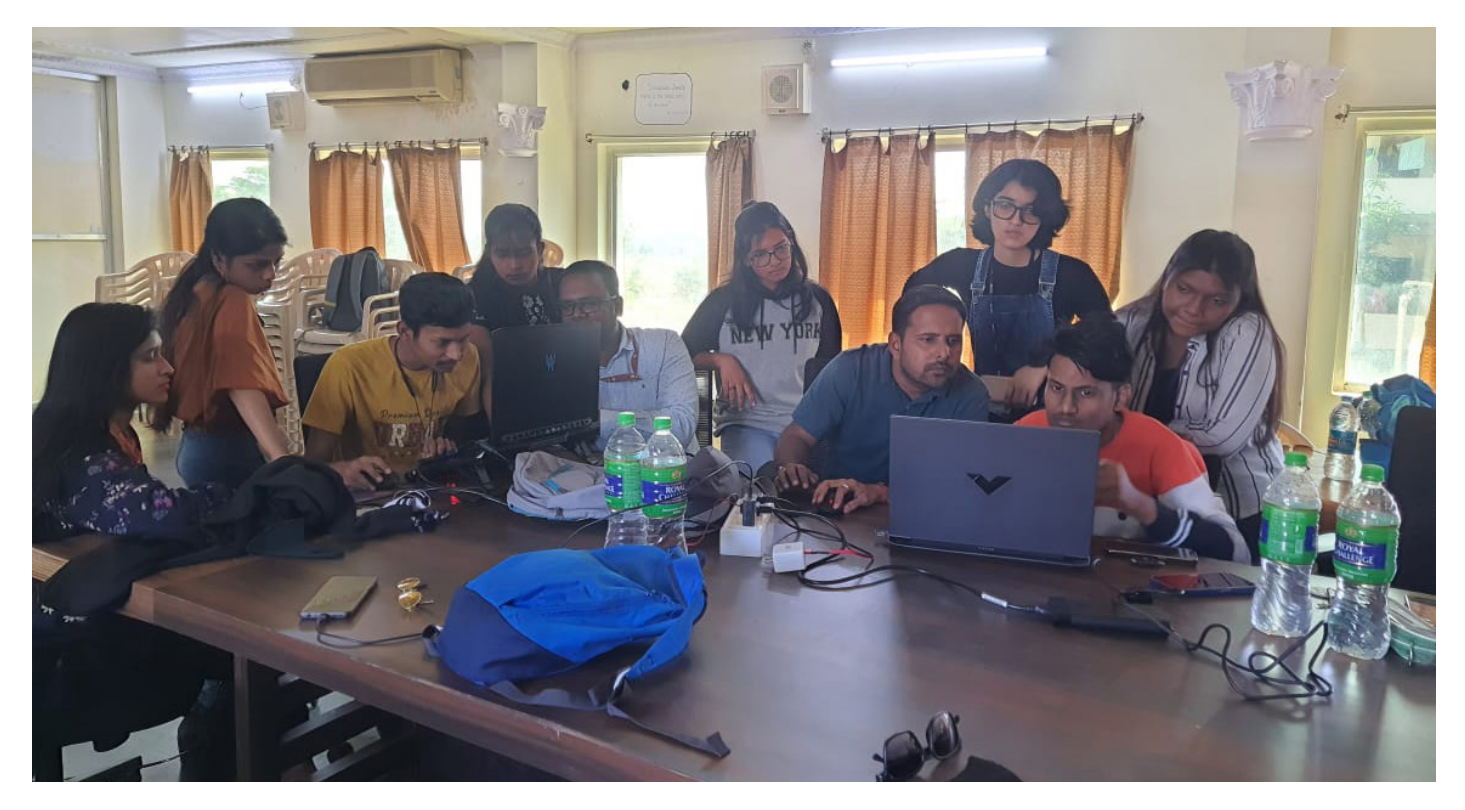
(A session on Editing)