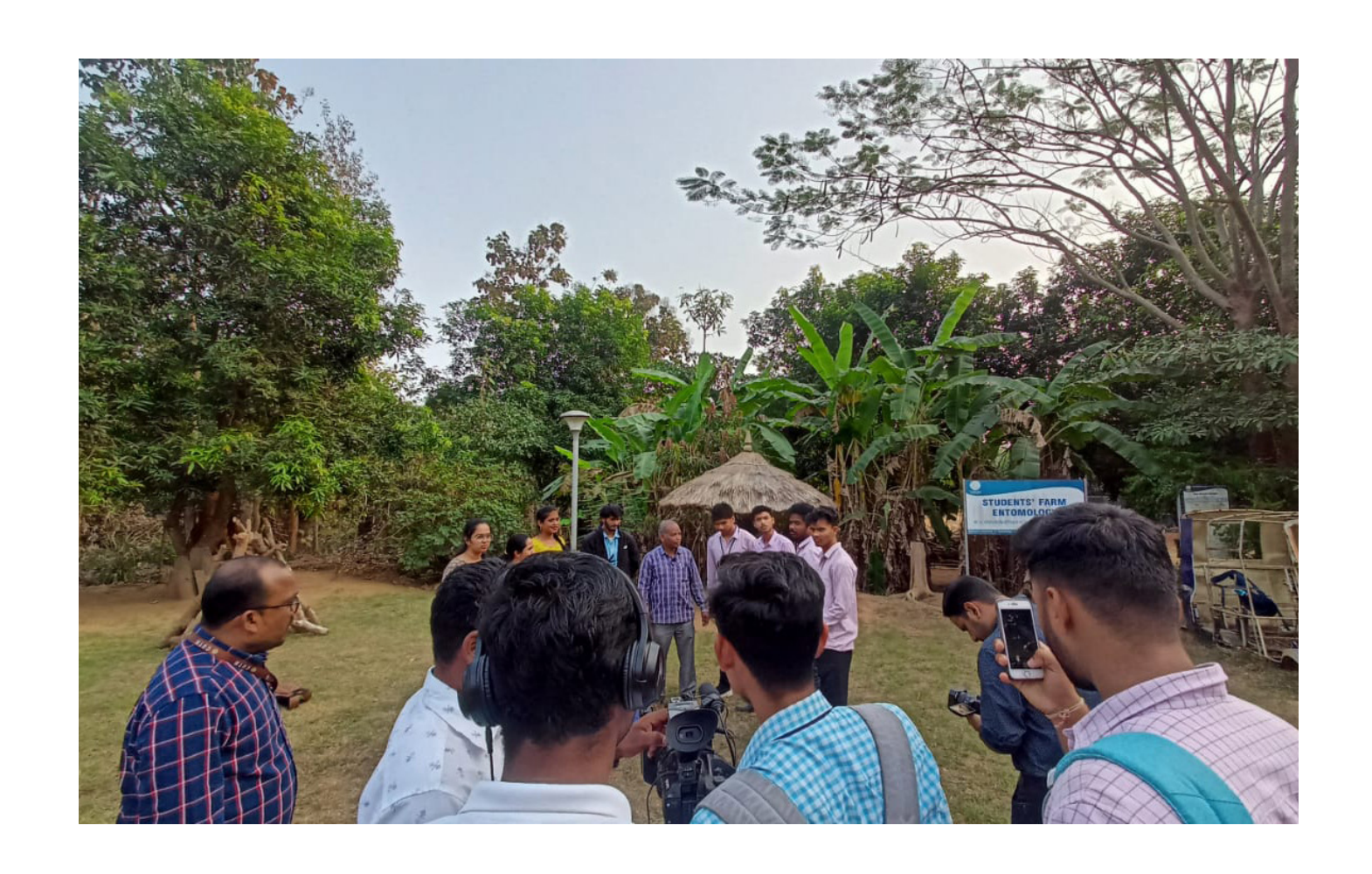
(Explain the location)