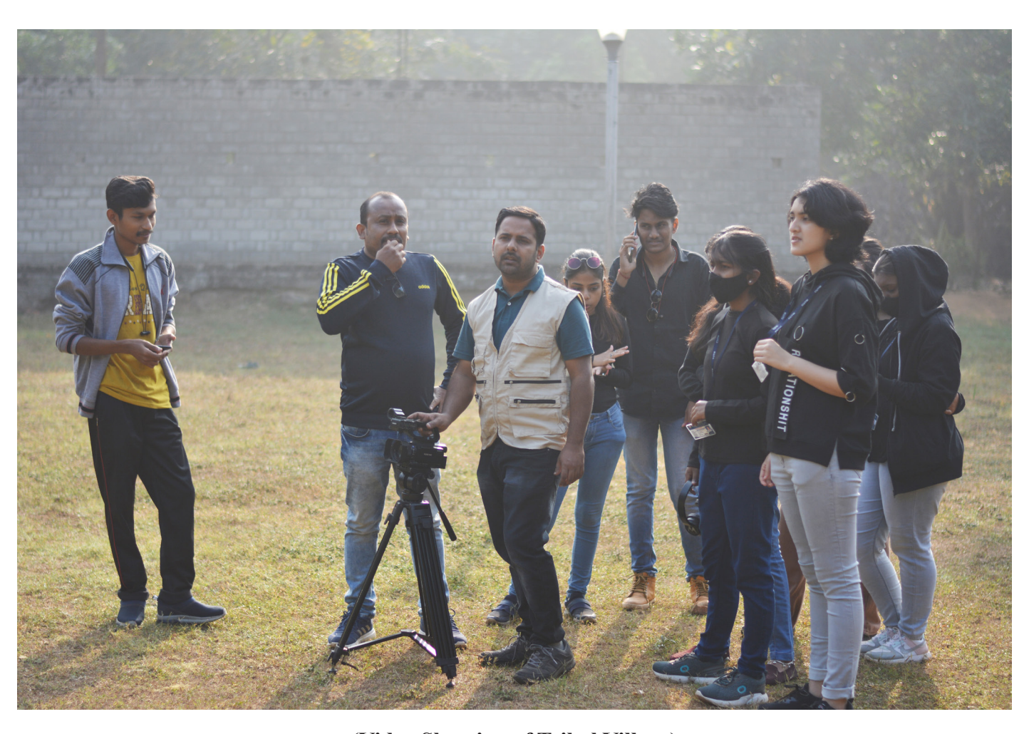
(Video Shooting of Tribal Village)