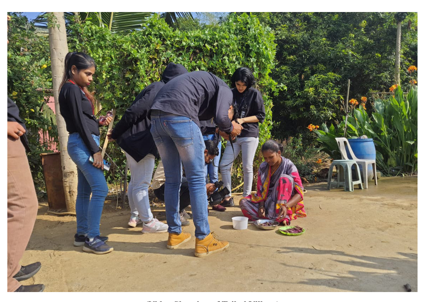
(Video Shooting of Tribal Village)