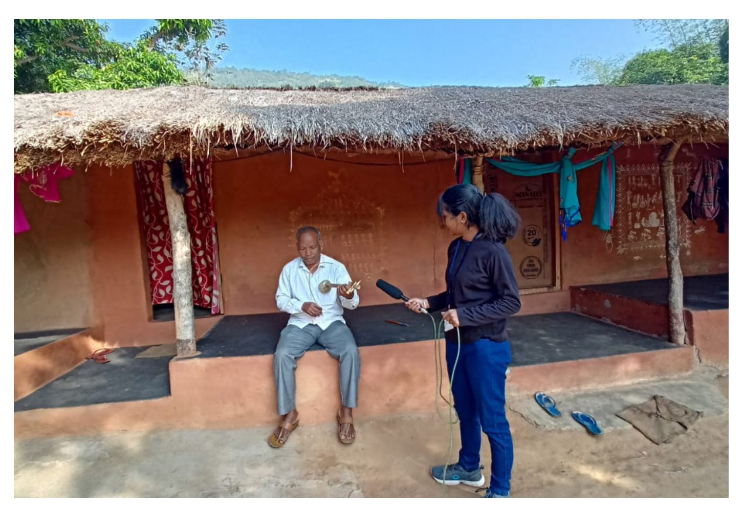
(Explain the location)