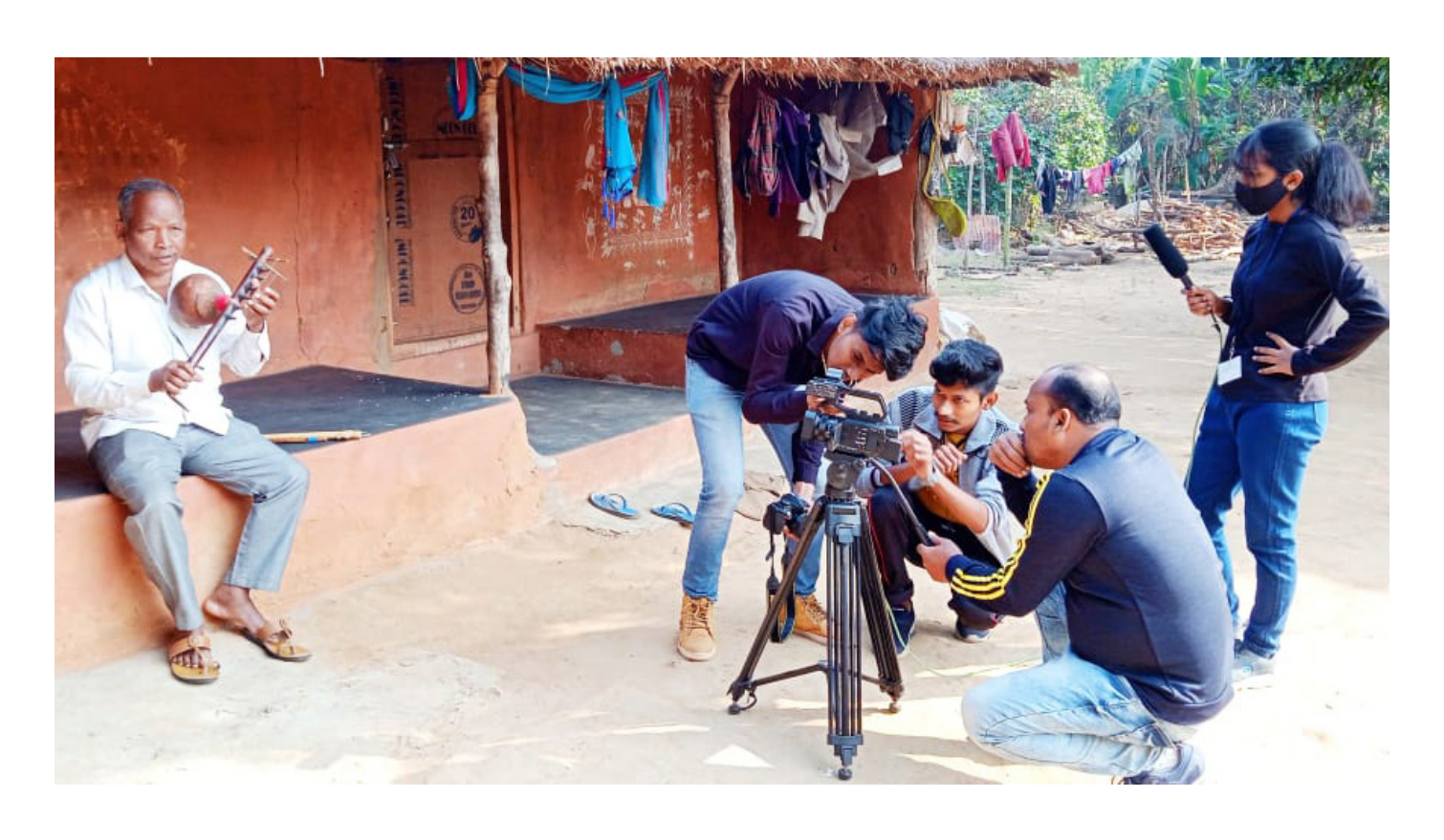
(Video Shooting of Tribal Village)