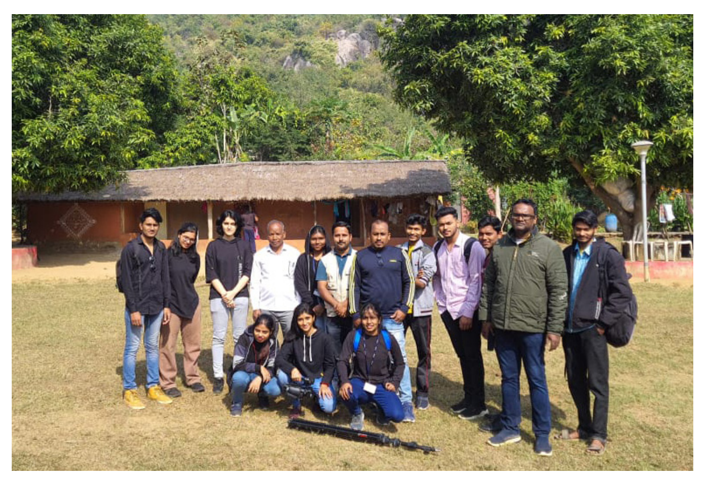
(Group Activity in Tribal Village)