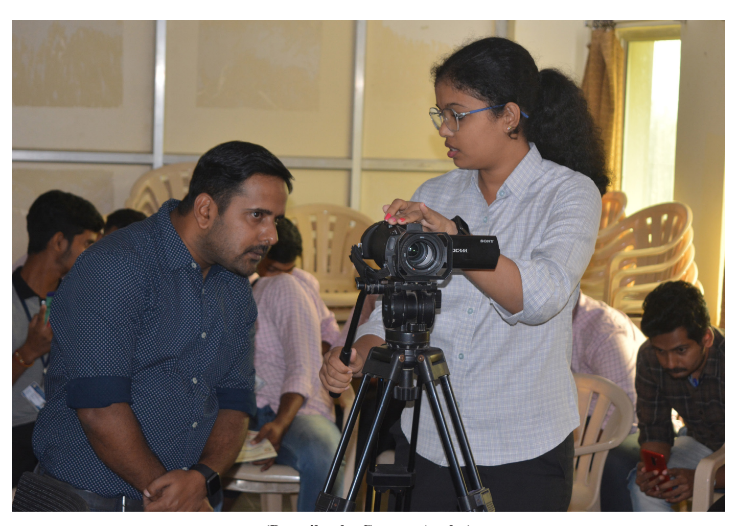
(Describe the Camera Angles)