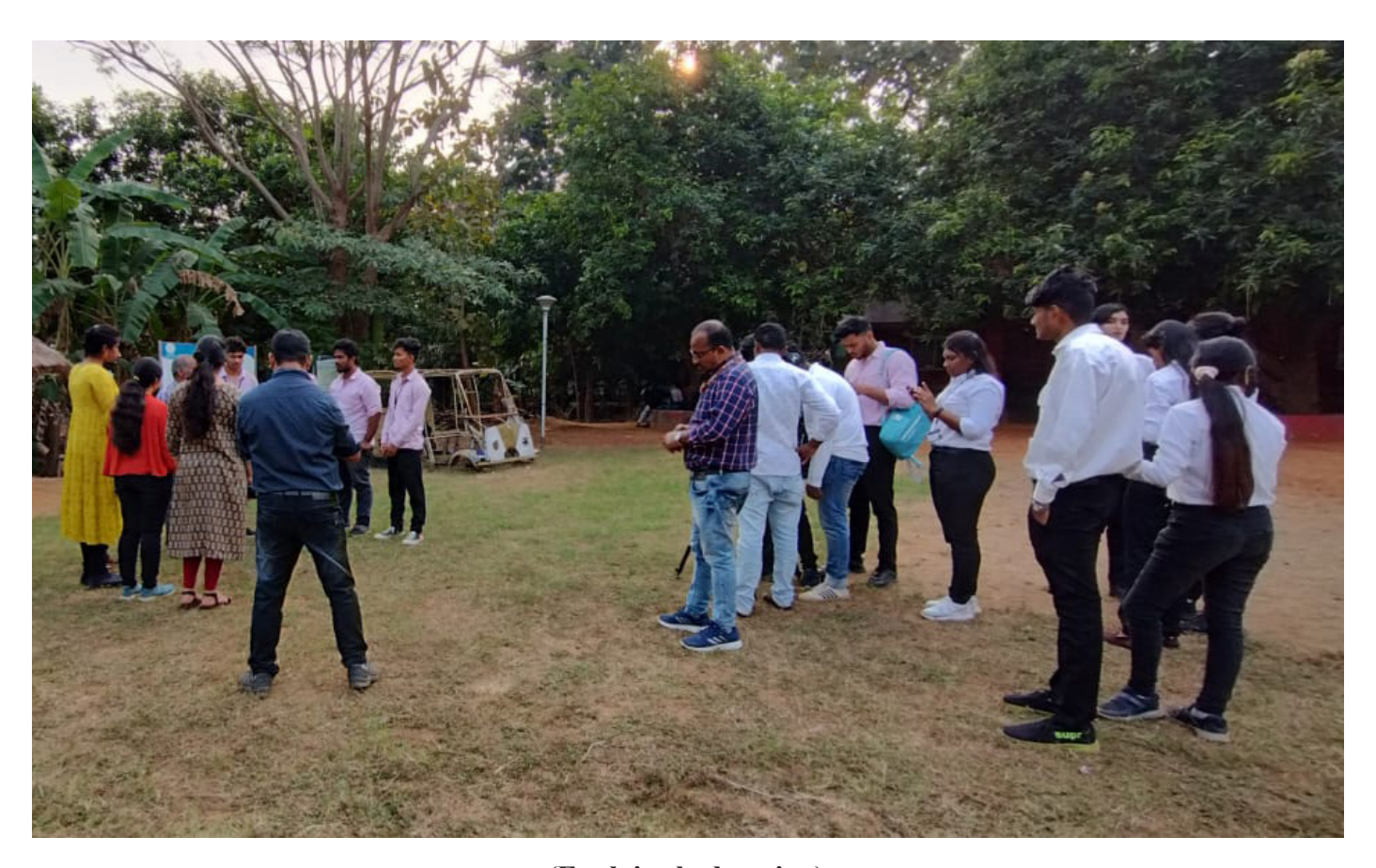
(Explain the location)