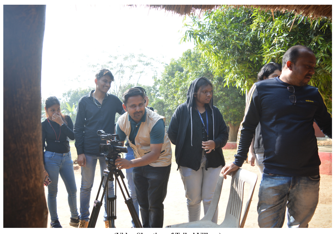
(Video Shooting of Tribal Village)