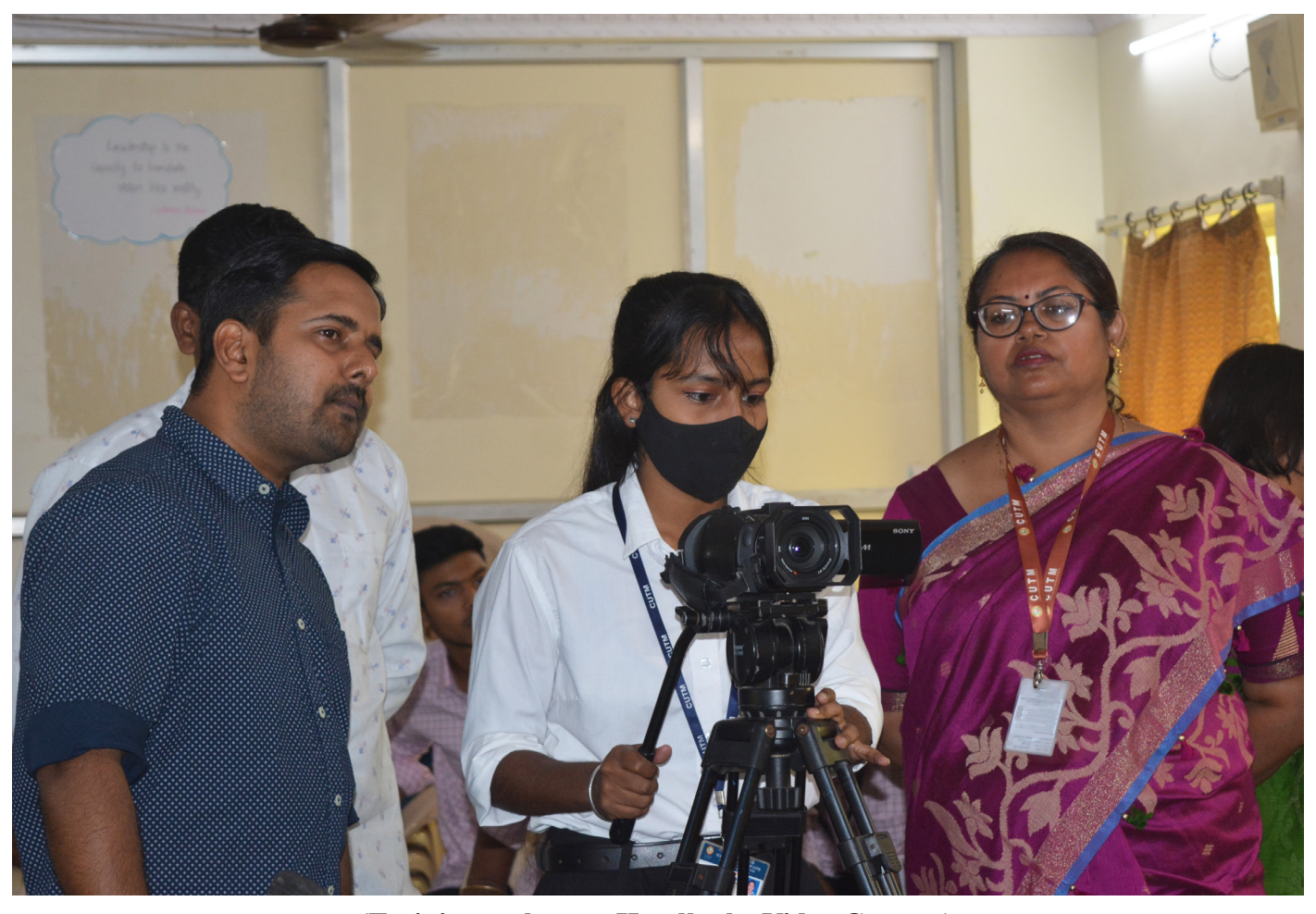
(Training on how to Handle the Video Camera)