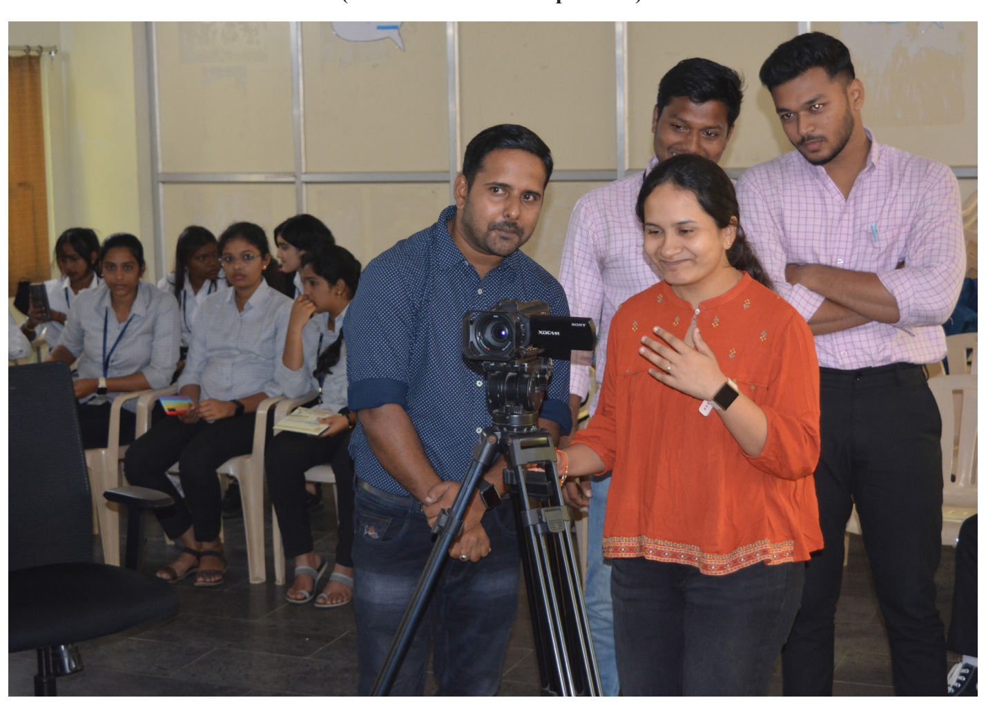
(Session on Camera Operation)