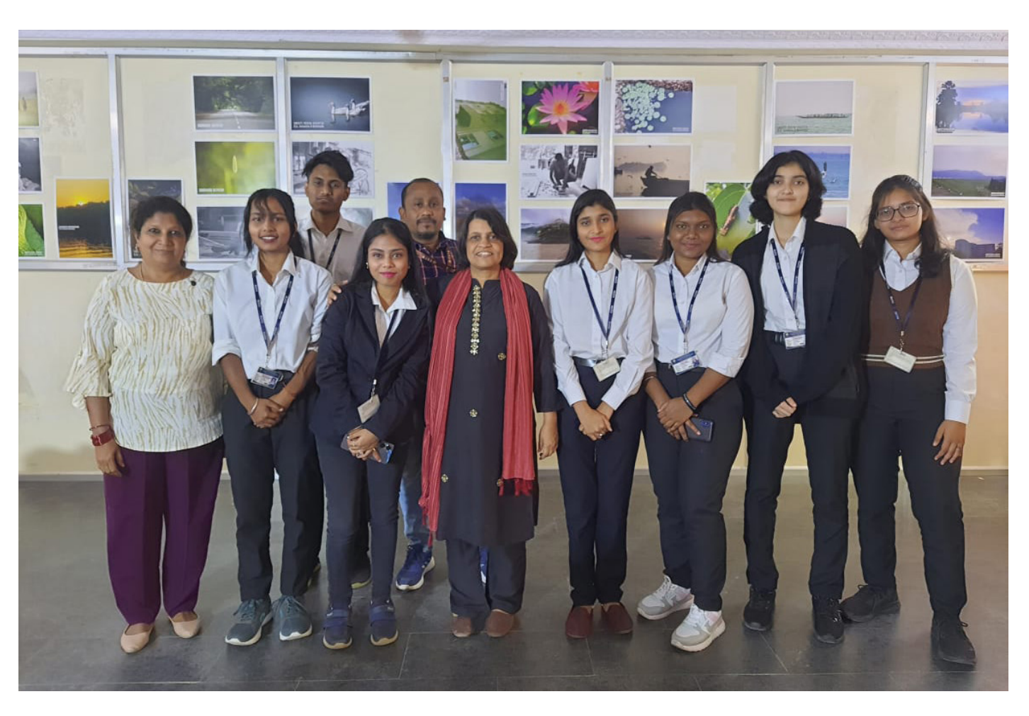
(Exhibition Participant and Faculty)