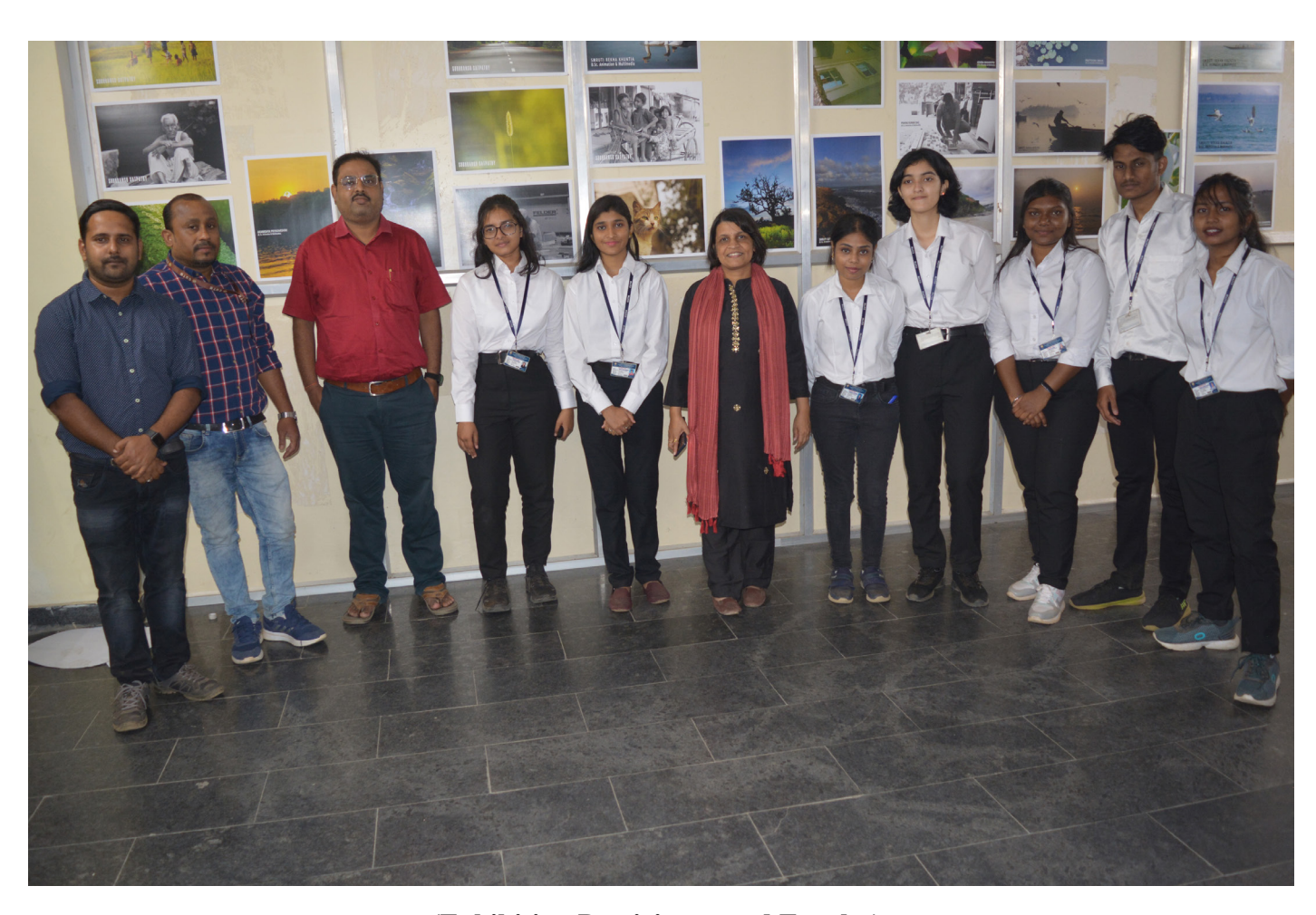
(Exhibition Participant and Faculty)