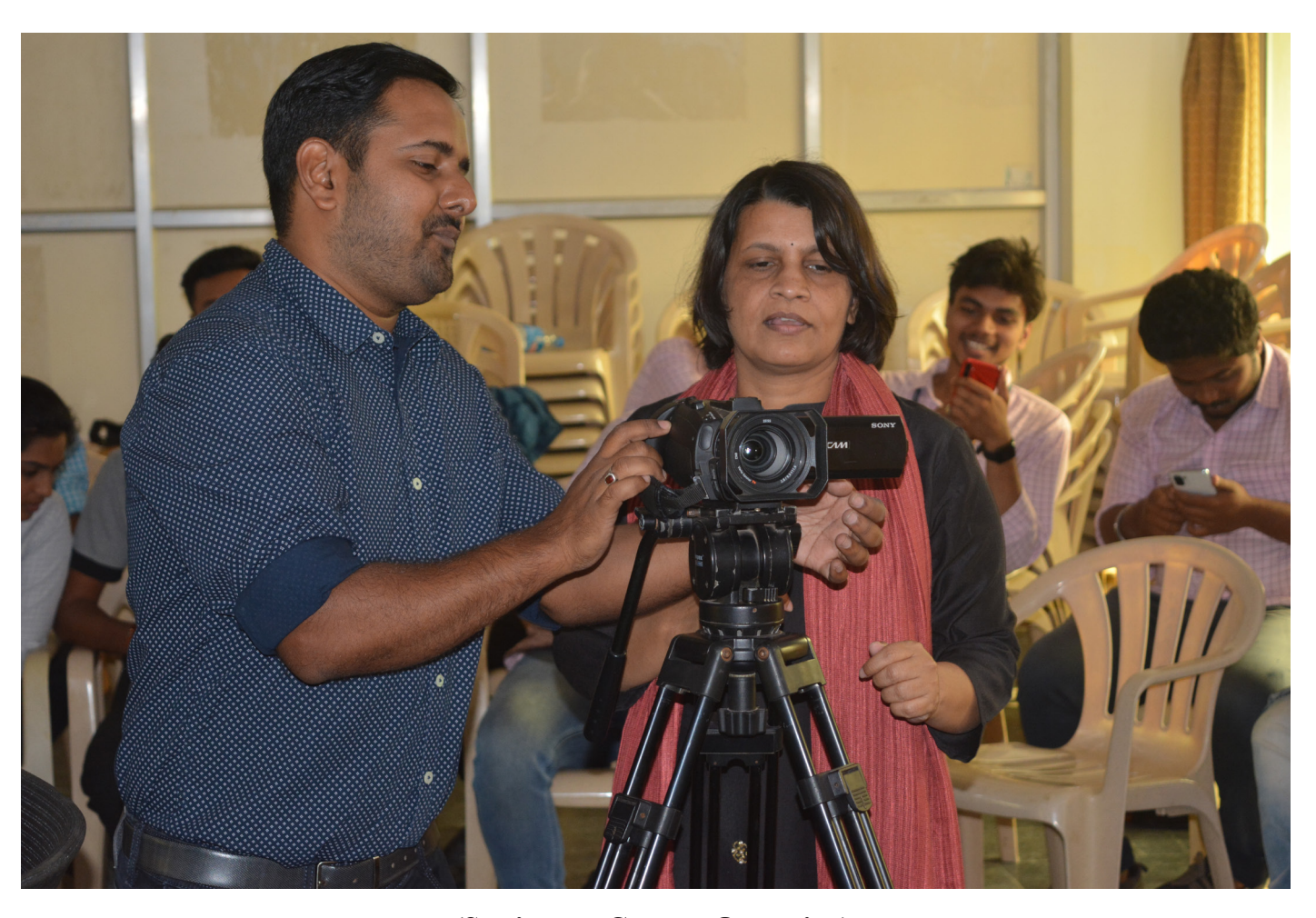
(Session on Camera Operation)