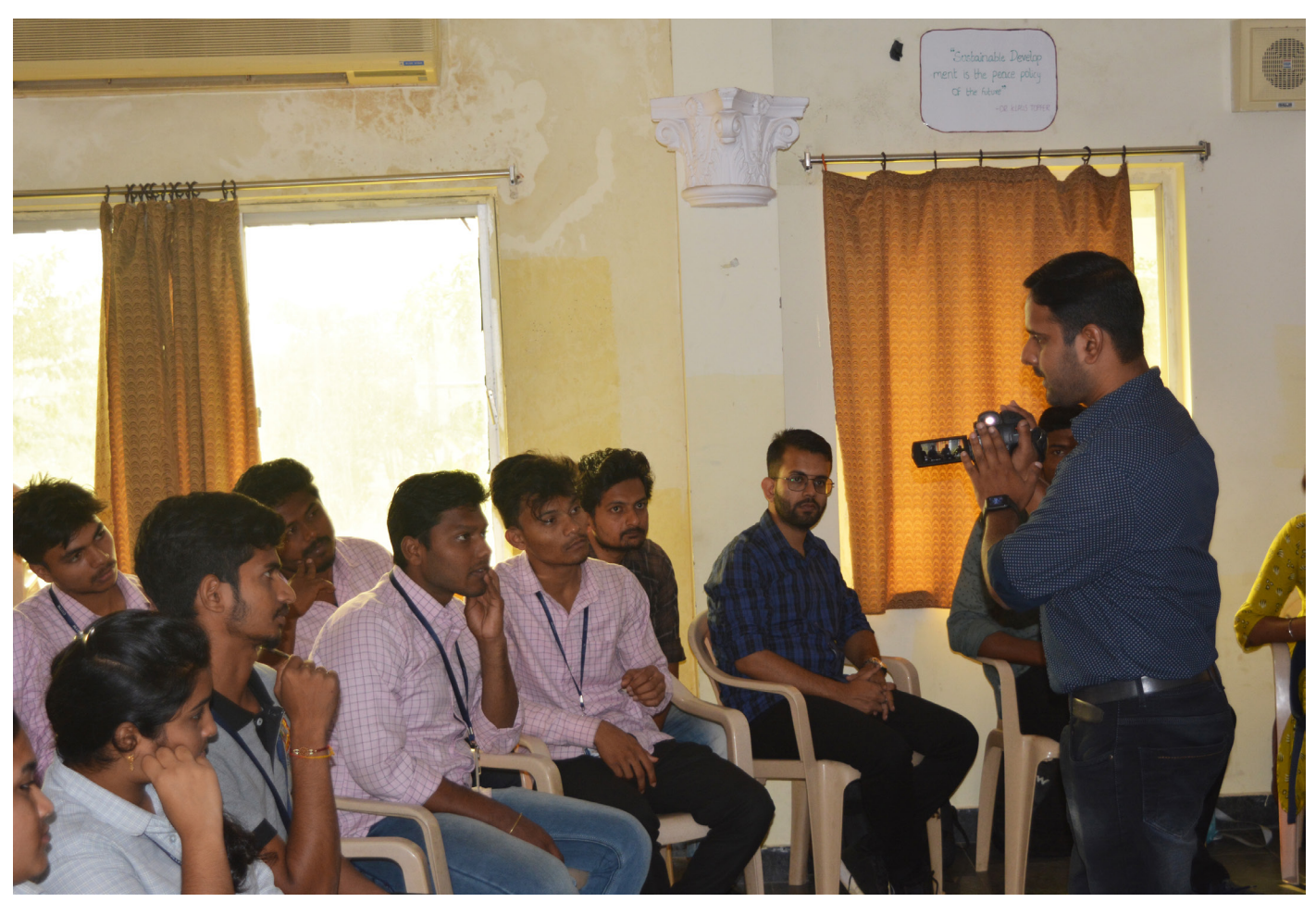
(Session on Camera Operation)