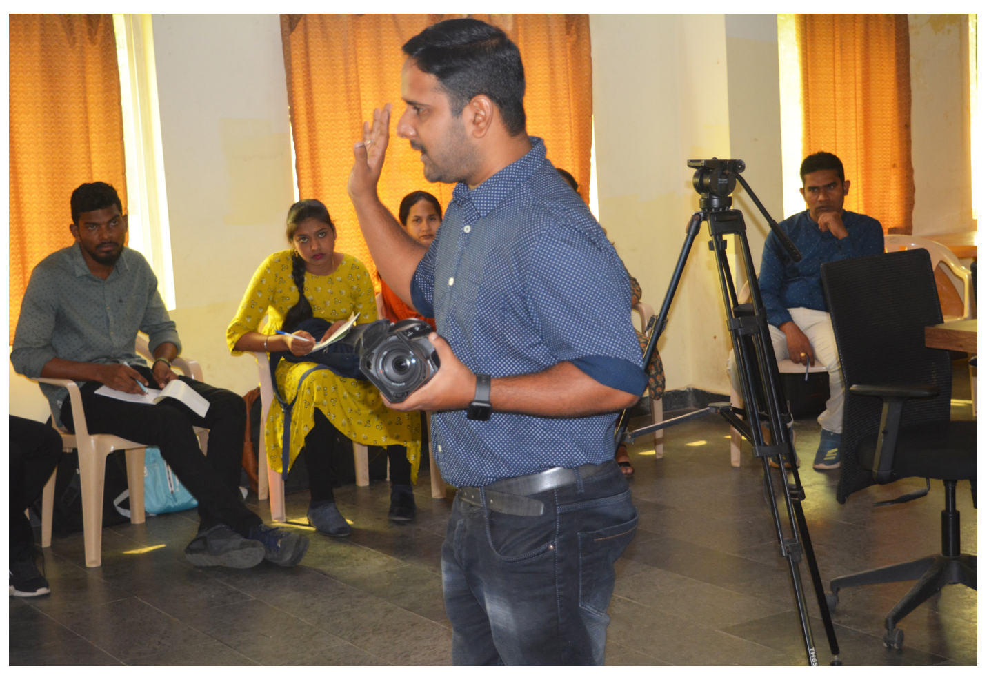
(Explain the different Angle Shots)