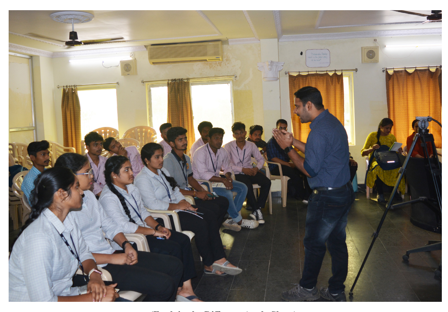
(Explain the Different Angle Shots)