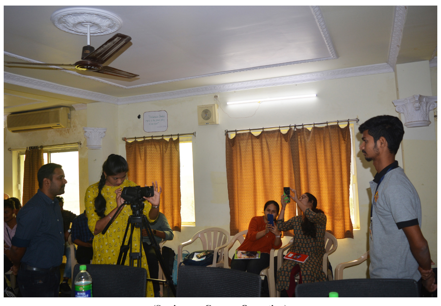
(Session on Camera Operation)