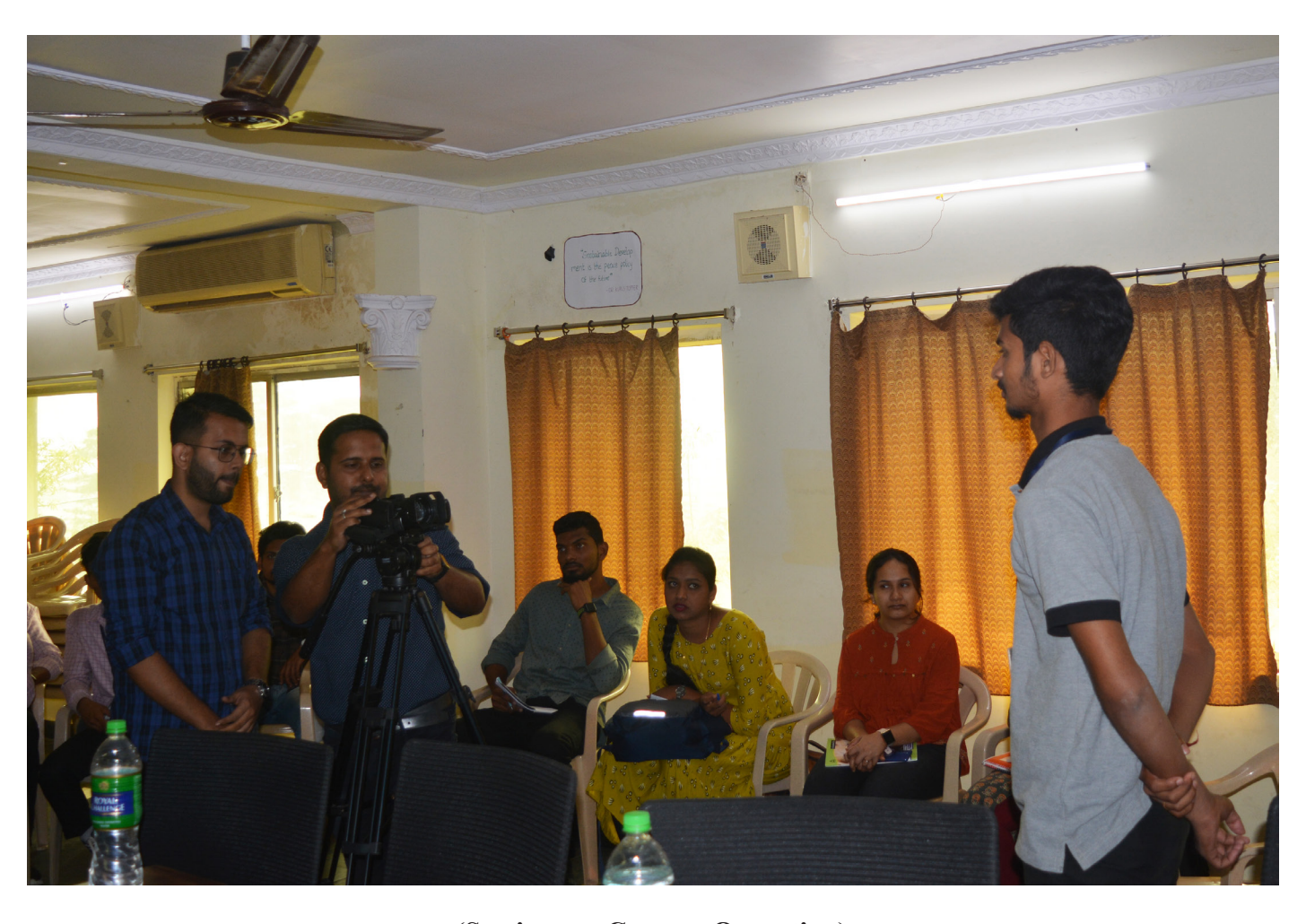
(Session on Camera Operation)