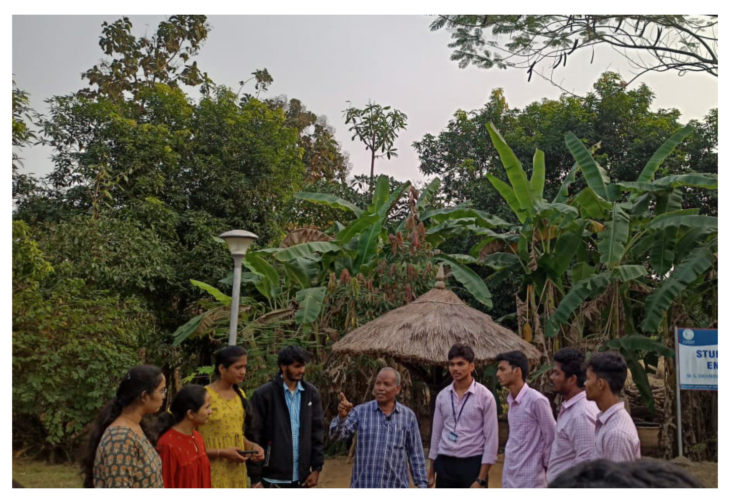
(Explain the location)