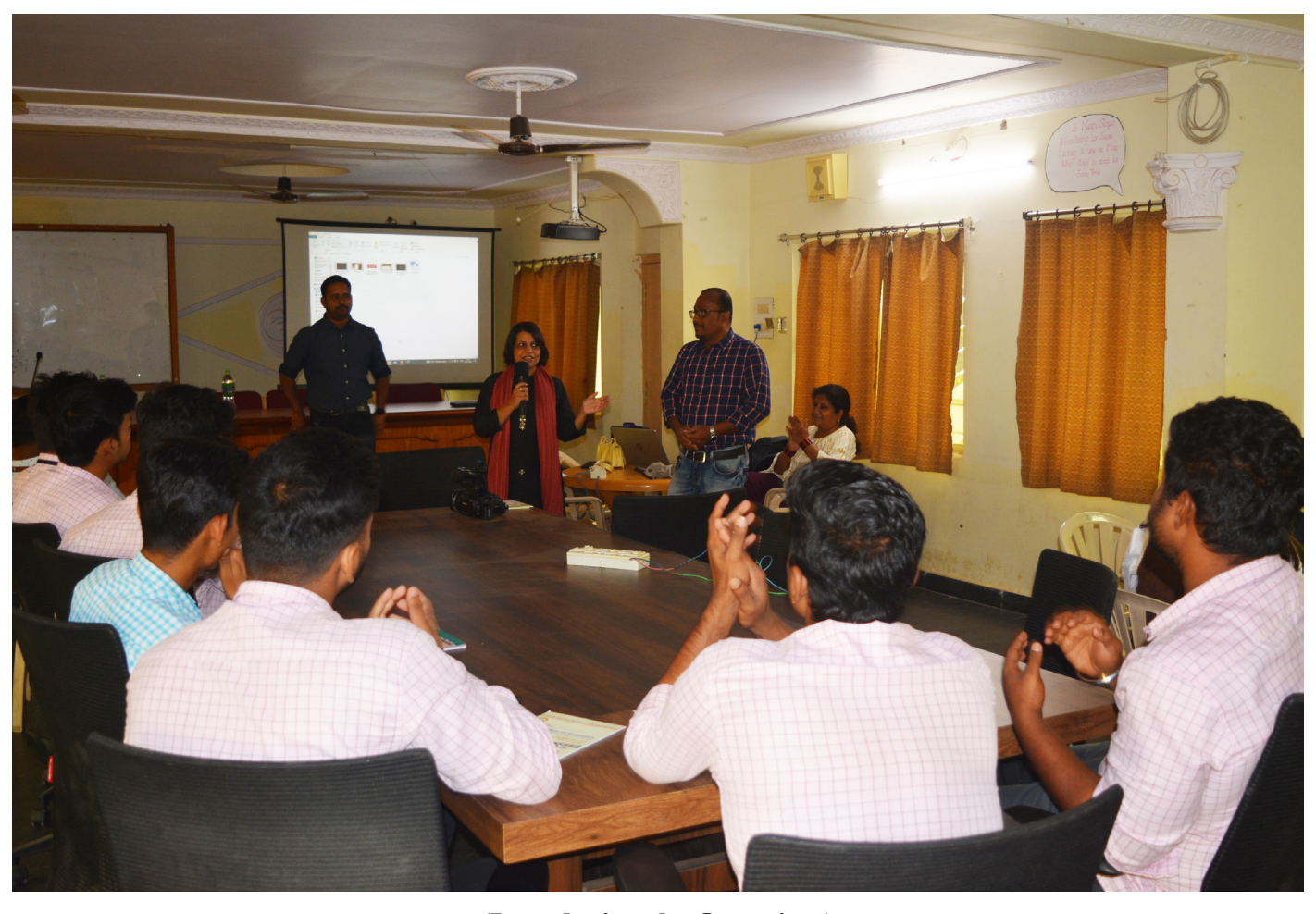
(Introducing the Organizer)