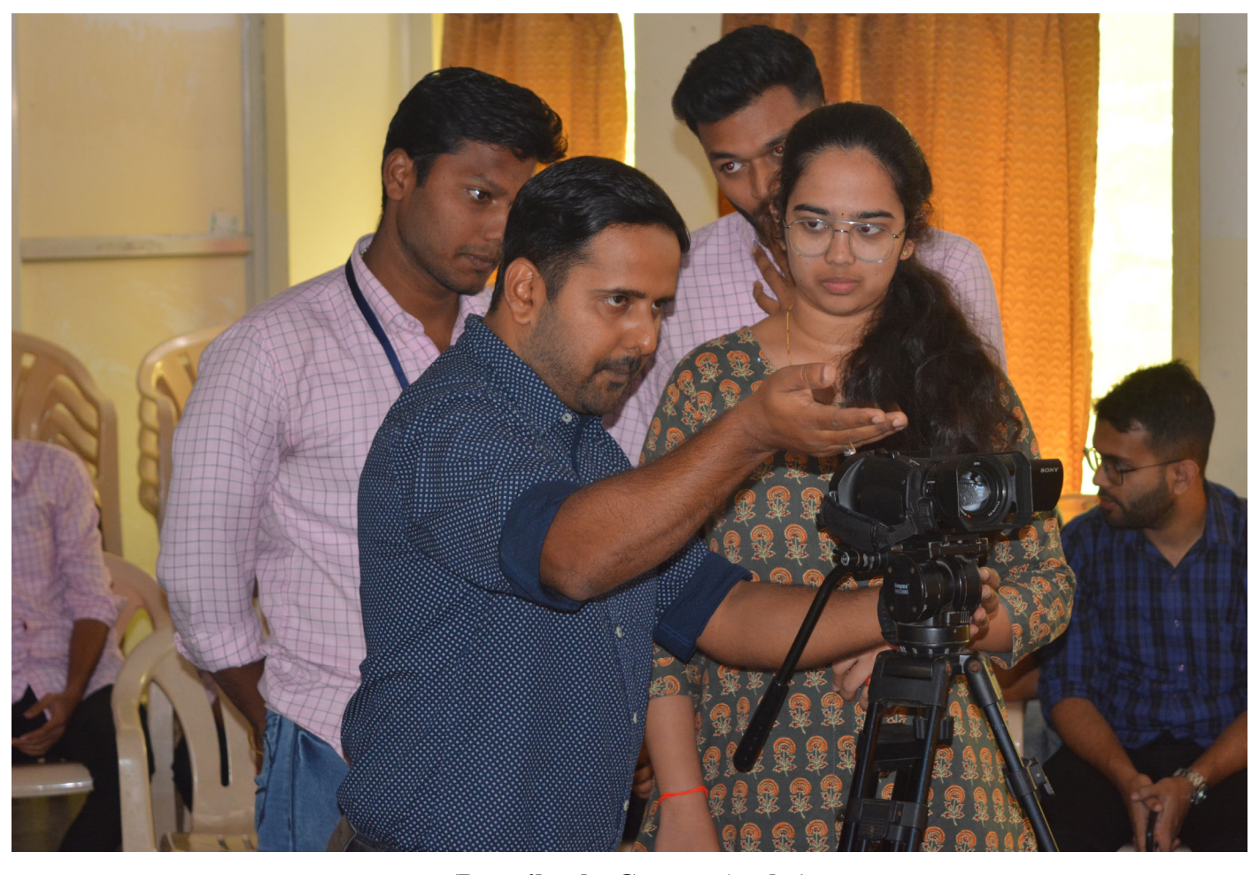
(Describe the Camera Angles)