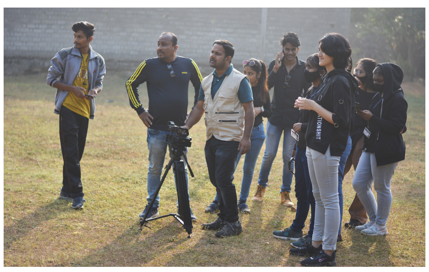
(Video Shooting of Tribal Village)