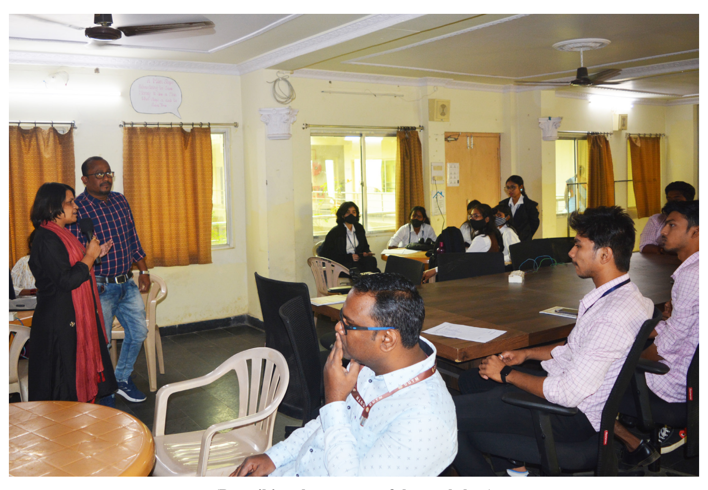
(Describing the purpose of the workshop)