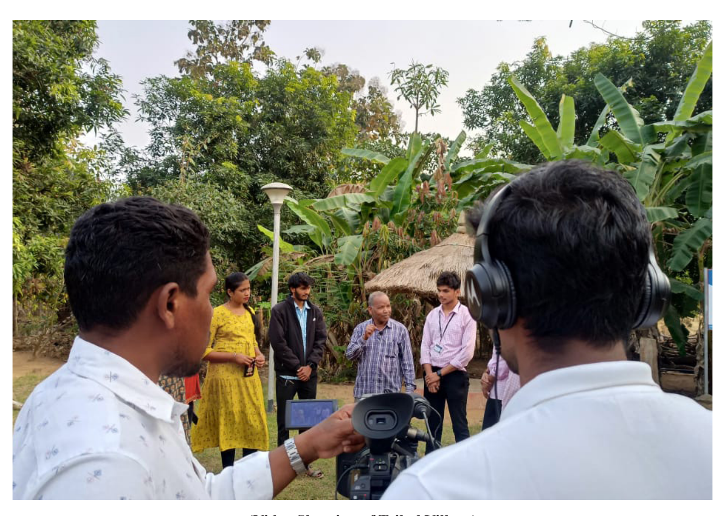
(Video Shooting of Tribal Village)