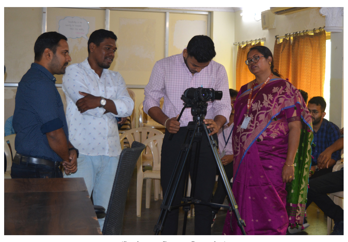
(Session on Camera Operation)