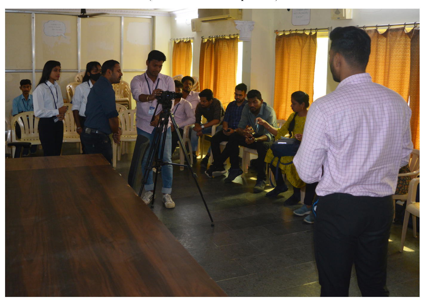
(Session on Camera Operation)