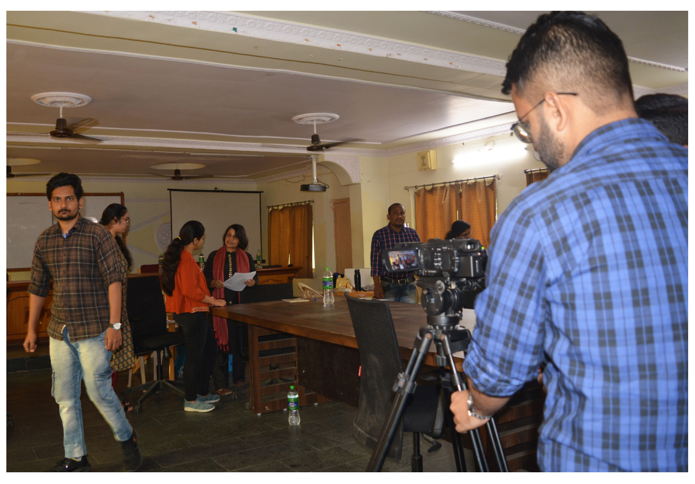
(Session on Camera Operation)