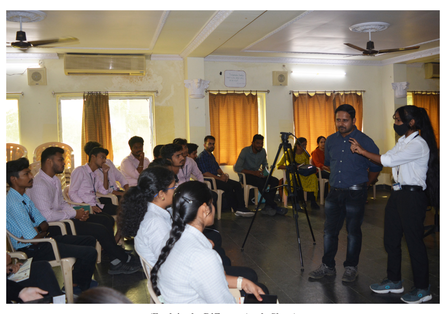
(Explain the Different Angle Shots)