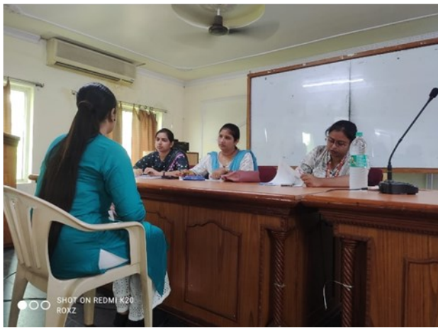
Fig: One to one mock interview for upcoming placement