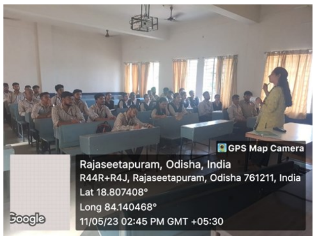
Fig: Technical subjects' discussion for placement interview