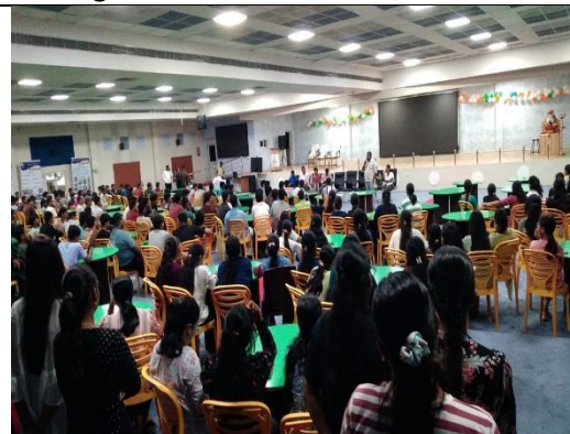
Student gathering of first years in Central Auditorium