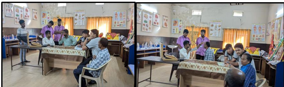
Figure 1: Free eye check-up for students, staffs and faculties of Centurion University

Centurion University exemplifies how higher education institutions can act as catalysts of financial inclusion and community empowerment. By integrating training, incubation, and financial assistance, the University nurtures an ecosystem where individuals and communities evolve from beneficiaries to entrepreneurs. From agriculture and fisheries to healthcare and technology startups, Centurion University’s initiatives have created a replicable model of grassroots entrepreneurship and sustainable development. Its alignment with national policies (Startup India, MSME, and Odisha Skill Mission) and global frameworks (UN SDGs) underscores its leadership in linking academia with inclusive growth. The University’s consistent engagement—through seed grants, community cooperatives, and training programs—ensures that financial assistance transforms into long-term economic resilience and social mobility. Through these efforts, Centurion University not only assists in the startup of financially sustainable businesses but also strengthens local economies, builds human capability, and contributes meaningfully to India’s pursuit of equitable and sustainable development.