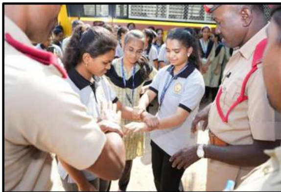
Figure 3: Disaster Management Awareness Training for the students of Centurion University