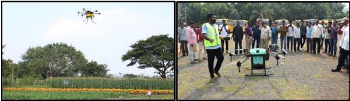
Fig 8: Drone Technology

Together, these initiatives strengthen livelihood security , drive rural innovation , and build the foundation for resilient, poverty-free communities across regional and remote areas.