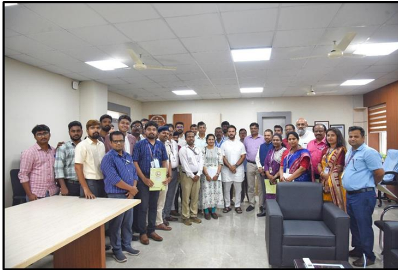
Figure 2. Startup meeting with Hon. Minister with Centurion University faculty and Vice President, Centurion University