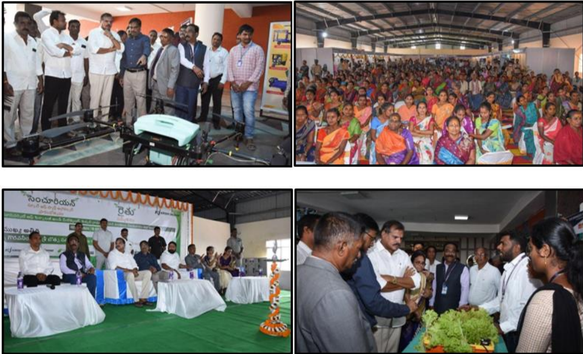
Fig 1: Utkal Krishi Mela 2024

To complement this community-focused innovation ecosystem, Centurion University invests in Faculty Development Programmes (FDPs) that embed the principles of sustainability, equity, and innovation across its academic framework. These programs enhance teaching quality, integrate SDG-aligned content, and build research and digital pedagogy capacity among educators. Faculty members are equipped with AI-integrated teaching tools and experiential learning methodologies that connect classroom learning to real-world societal challenges.