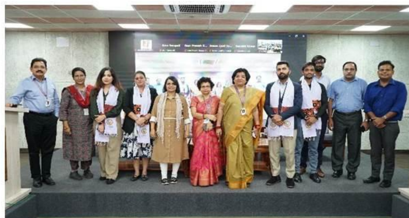
Inauguration of Global Education Fair