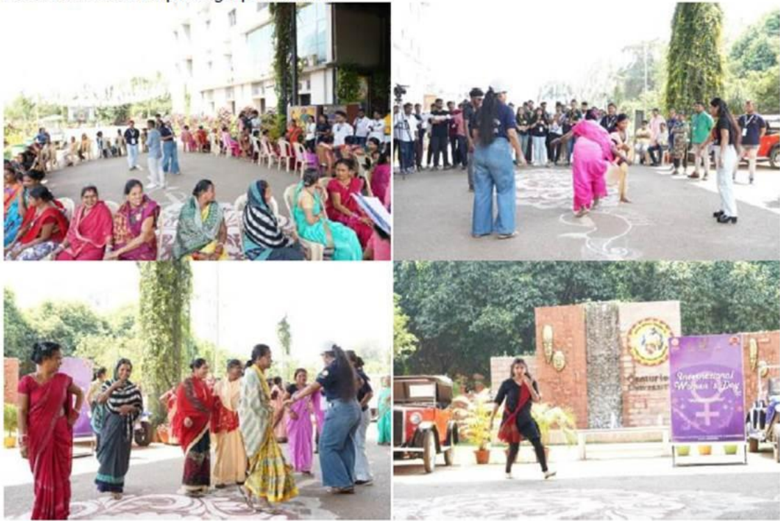
Images of musical chair competition and Cultural event with housekeeping staff and students on Women’s Day