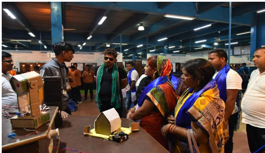
Fig. 13 shows demonstrations under PMKVY training.