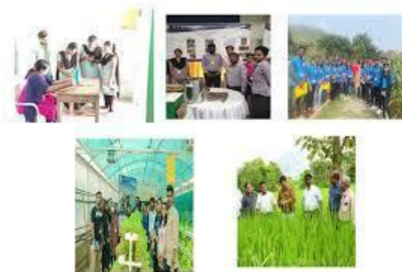
Fig. 7 Skill based training initiatives in Centurion University.