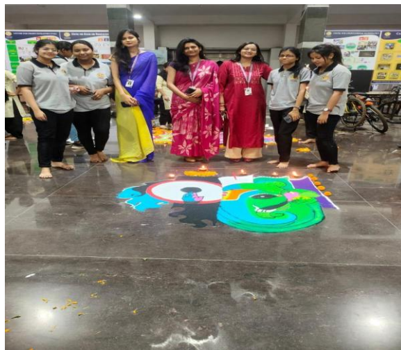
Fig. 4 shows the art work done by Centurion University students under faculty guidance.