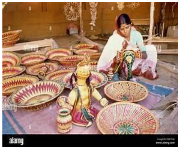
Fig. 1 Making of traditional work supported by Centurion University initiatives