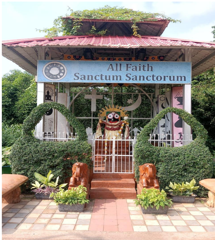
Fig. 2 shows the all faith sanctum sanctorum

regional community, transcending institutional boundaries to create inclusive spaces for collective celebration and spiritual engagement.