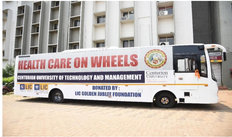
Fig. 10 shows HCOW vehicle