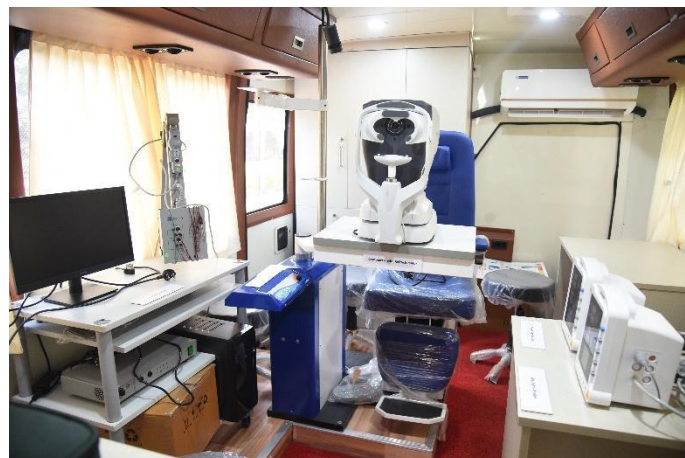
Fig. 9 shows the interior of the HCOV vehicle upgraded per state of the art standards