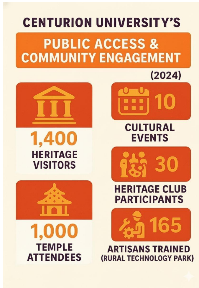
Fig. 8 shows public access and community engagement milestones for the year 2024.