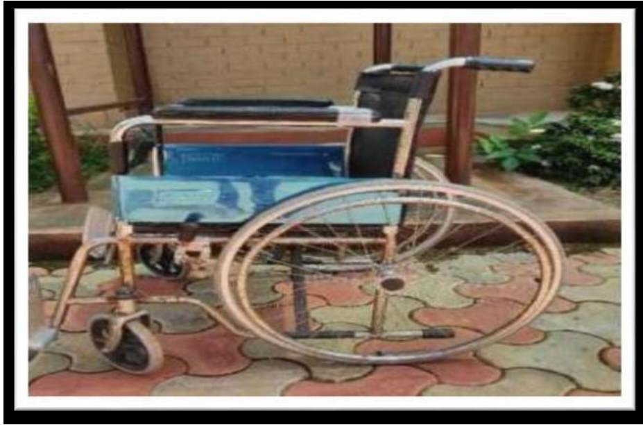
Fig. 12 The disabled friendly initiatives by Centurion University in 2024.