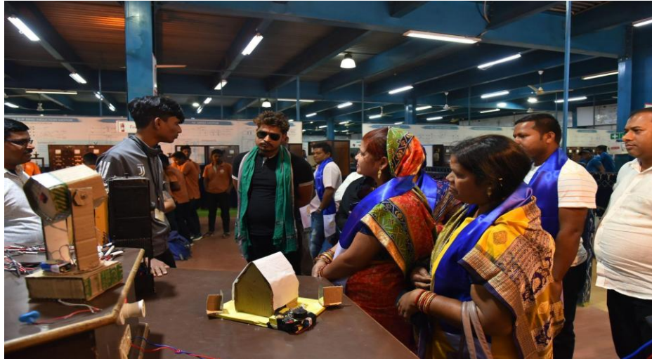
Fig. 6 shows the demonstration by PMKVY centre