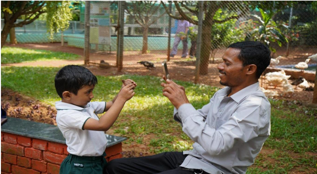
Fig. 10 shows outreach activities to include tiny tots into Centurion University.