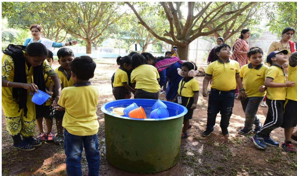
Fig. 2 shows free public access initiatives in Centurion University.