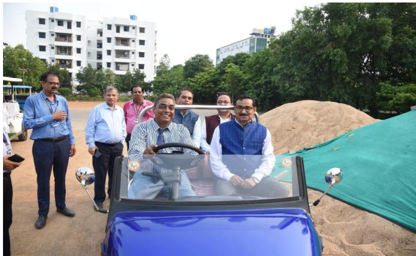
Fig. 9 shows the guests with our vintage Electric car around the campus.