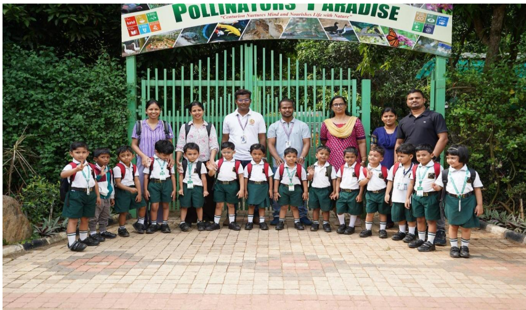
Fig. 7 shows campus tour and interactive sessions with tiny tots.

Schools Participated: 5 (from Berhampur, Vizianagaram, and nearby rural areas). Visitors: 510 students and 55 teachers. Campus museum tours, guided biodiversity walks, sports competitions, and interactive career counselling sessions