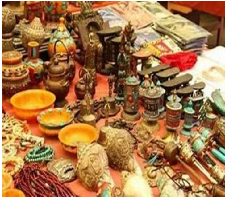
Fig. 3 Local tribal artifacts been showcased in the University Museum

traditional crafts, artefacts, and displays that narrate the unique lifestyles and histories of these groups. In 2024 around 1000 visitors had visited the tribal village museum.