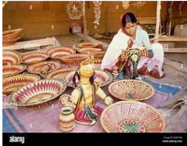
Fig. 5 shows Making of tribal handmade home and personal decors