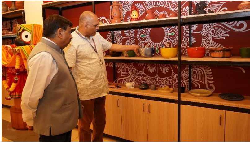
Fig. 2 shows Hon'ble President explaining the Waste to wealth system of the University.