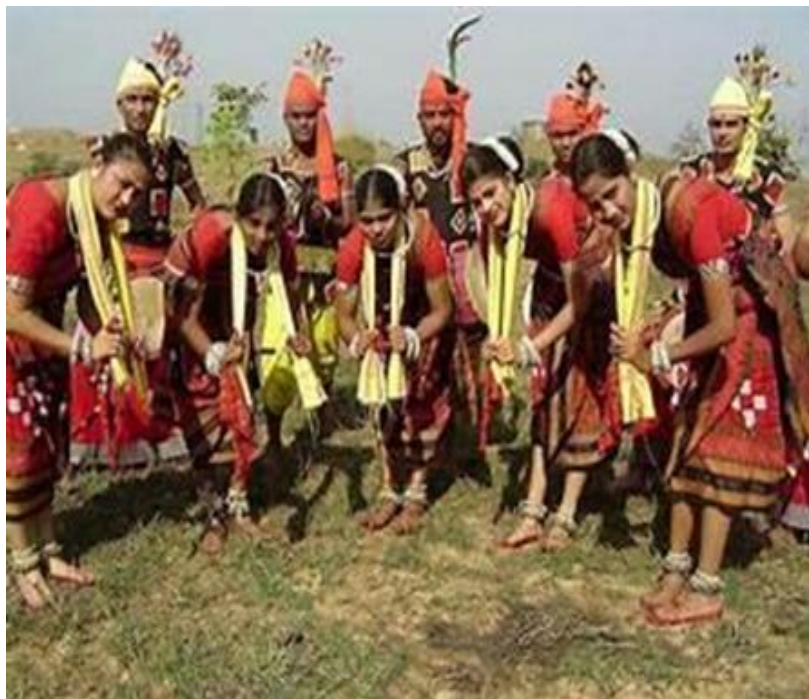
Fig. 4 shows Tribal dance being performed at the University to preserve the same