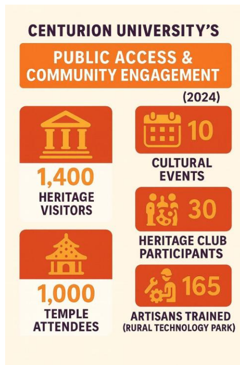
Fig. 8 shows public access and community engagement milestones for the year 2024.