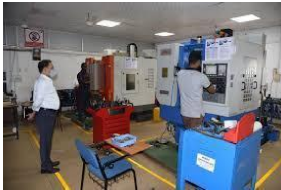
Fig. 11 shows Hands-on training in our engineering workshop.