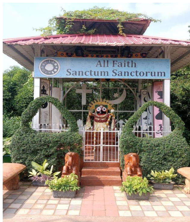
Fig. 6 shows the all faith sanctum sanctorum.