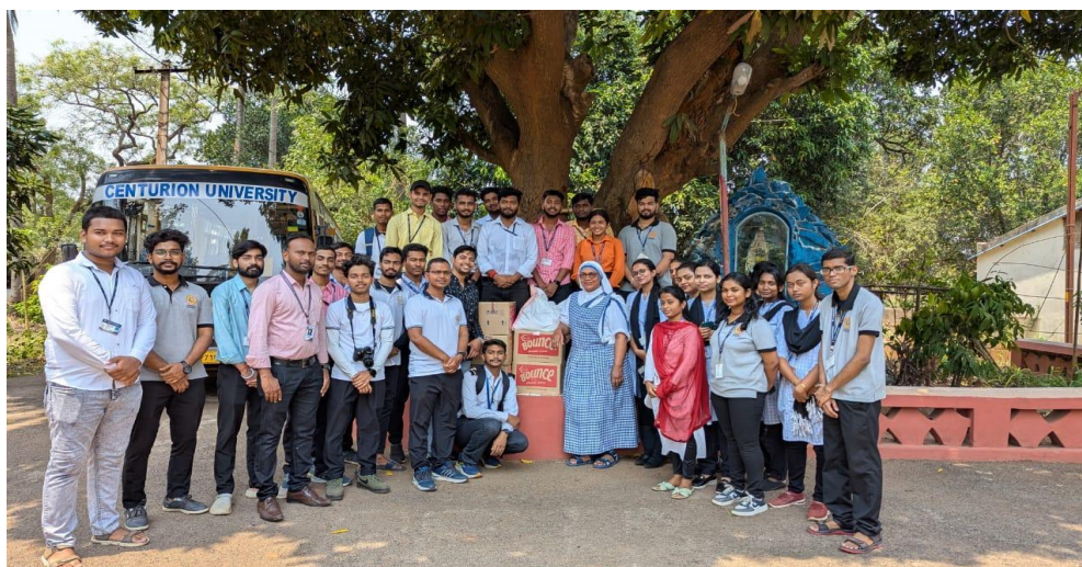
Fig. 1 shows the key initiatives to show community collaboration.

Community meetings/workshops held (2024): 12 (Paralakhemundi: 5; Bhubaneswar: 7). Individuals interviewed/recorded: 180 elders and practitioners across listed sites. Local languages/dialect samples documented: 6 (including local Gajapati/tribal dialects). Public dissemination: 4 community presentations and 2 open-access collections on the University repository.