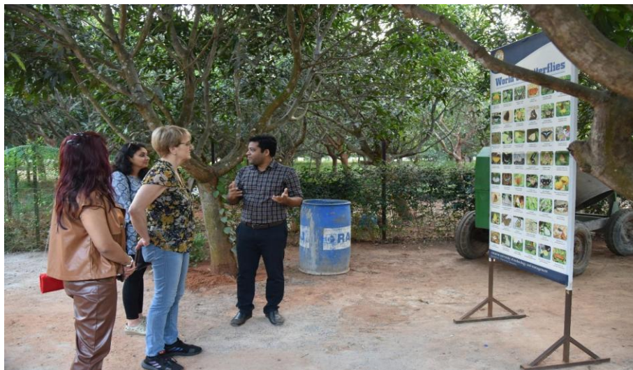
Fig. 4 shows the CUTM initiatives for community sharing and exhibition.