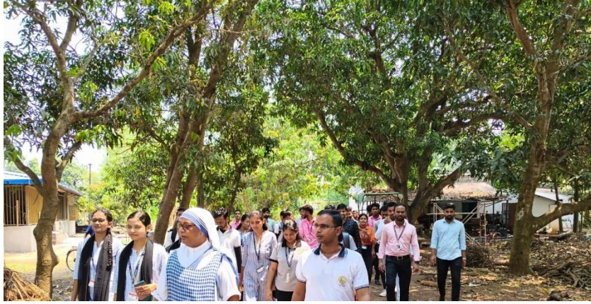
Fig. 5 shows the cultural showcases in CUTM

CUTM Bhubaneswar's recent work demonstrates a strong, multifaceted commitment to preserving and celebrating the region's intangible cultural heritage, ensuring that these traditions remain a vibrant part of contemporary society