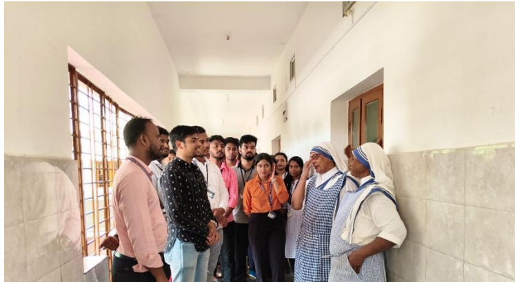
Fig. 2 shows about the CUTM programmes for public engagement and knowledge sharing.