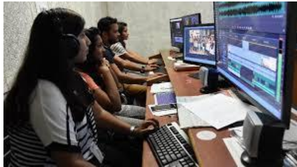
Fig. 1 shows the hybrid model used by Centurion University students.