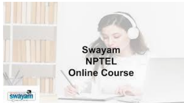
Fig. 4 shows NPTEL Online Course platform.