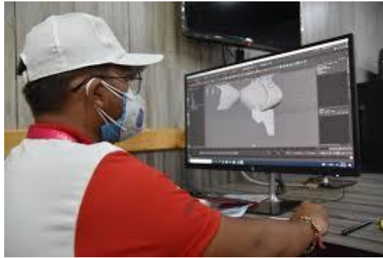
Fig. 2 shows remote and flexible work by Centurion University.