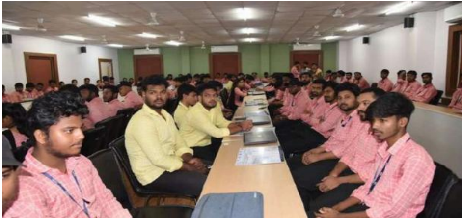
Fig. 6 shows the engagement of students in accessible education for all policy.

Centurion University's strategic adoption of flexible work policies and advanced communication tools epitomizes its drive toward operational excellence, sustainability, and inclusive access to education and employment.