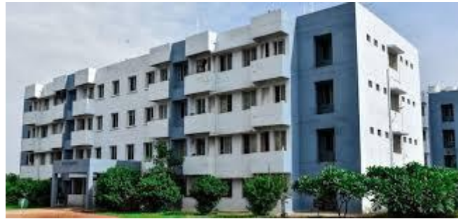
Fig. 1 shows the hostel in Centurion University campus.