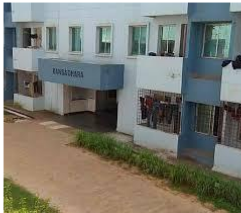
Fig. 2 shows Kushabhadra hostel in Centurion University campus.