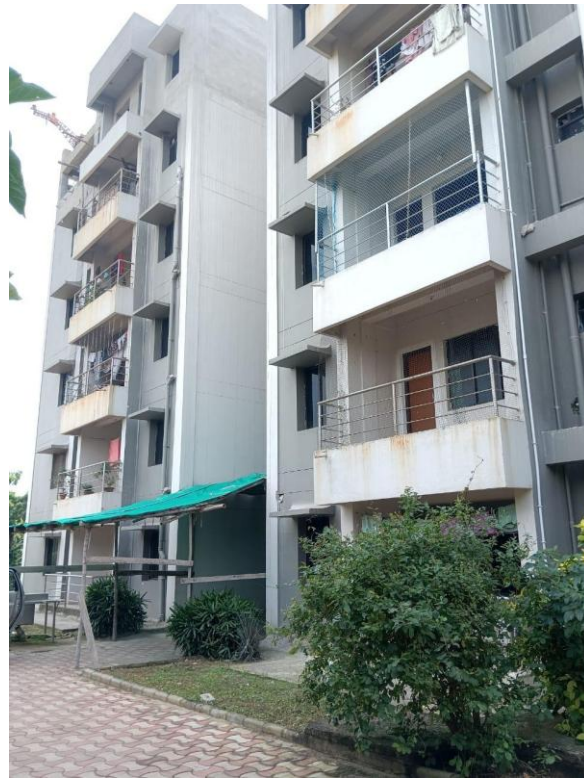
Fig. 4 shows the front part of Centurion University hostel.