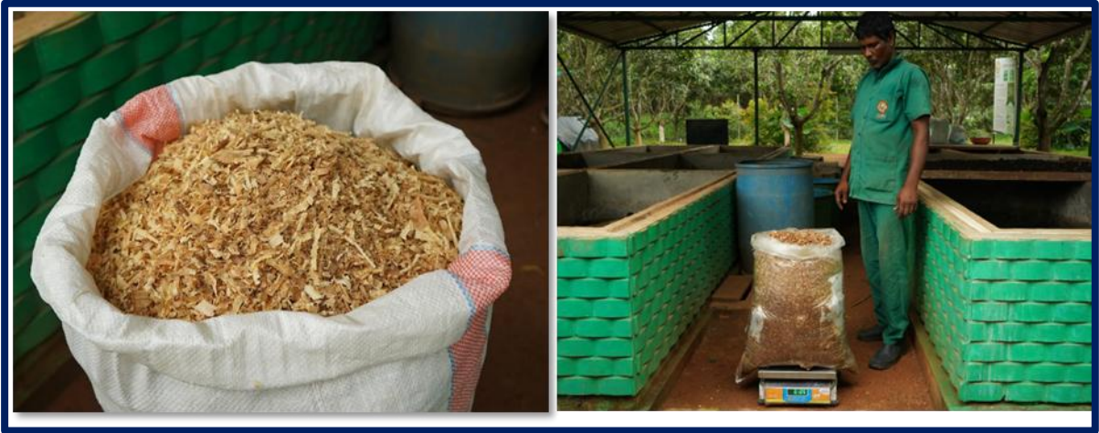
Fig. 10 Collection and measurement of wood waste