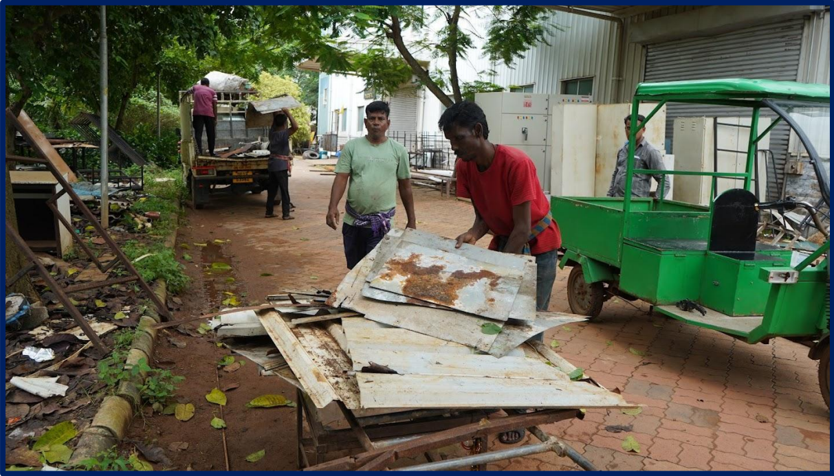
Fig.13 Collection of metallic waste