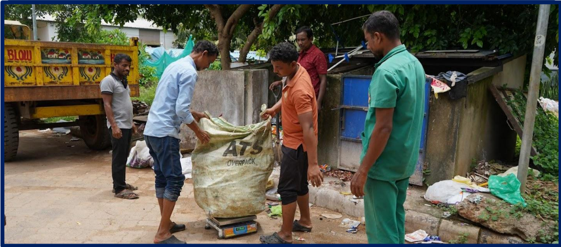
Fig. 12 Collection and measurement of plastic wastes