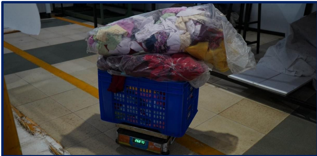
Fig. 11 Collection and measurement of Cloth waste