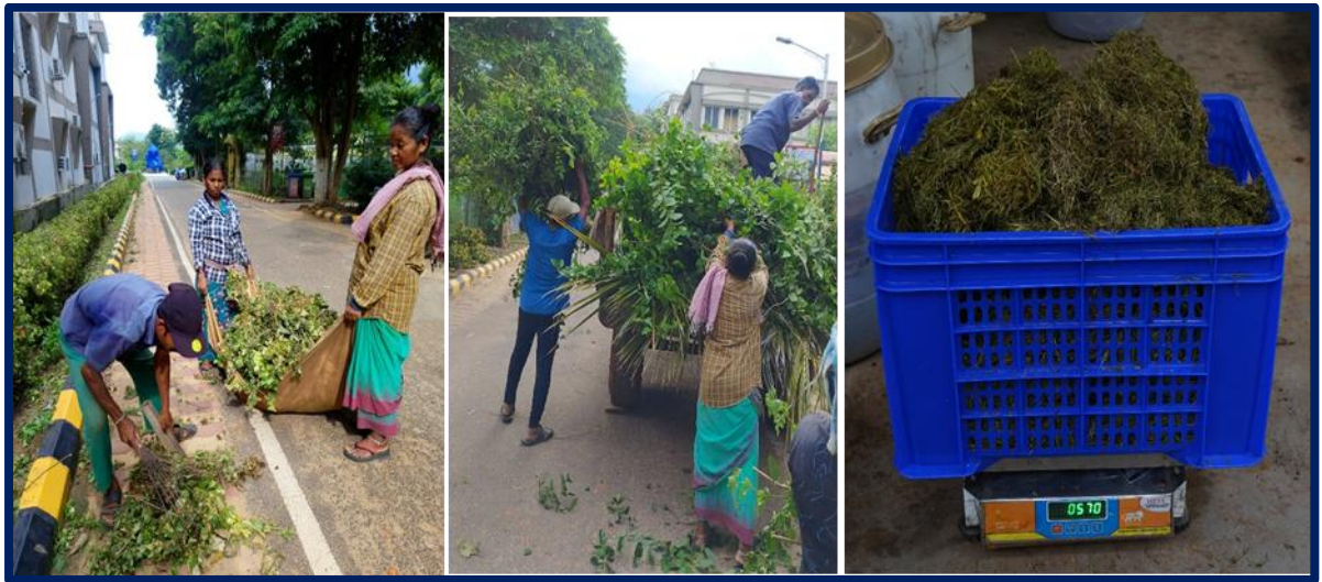
Fig. 4 Collection and Measurement of green waste