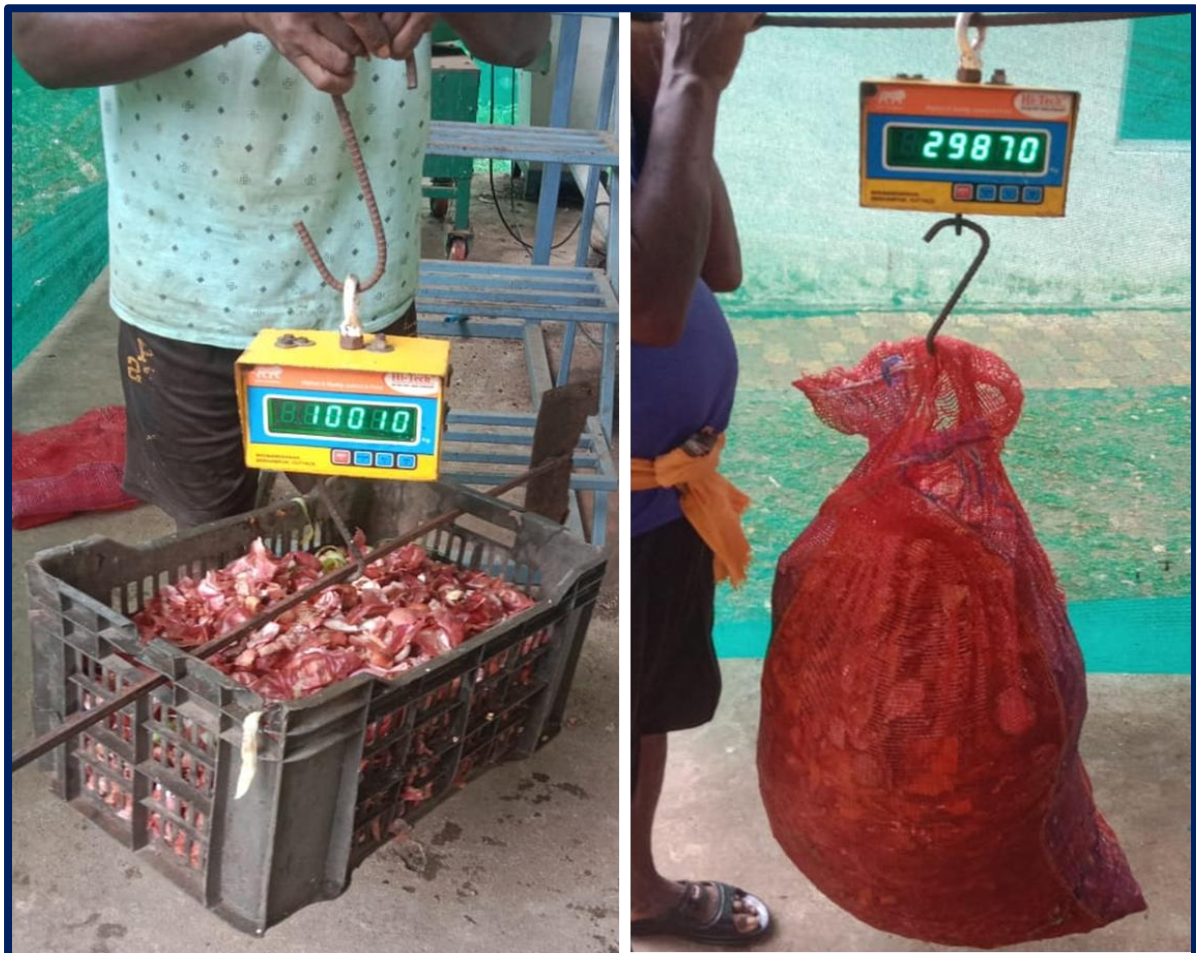
Fig. 9 Measurement of vegetable waste