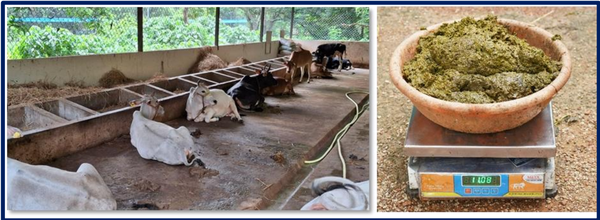
Fig. 5 Collection and Measurement of cow dung from cattle shed