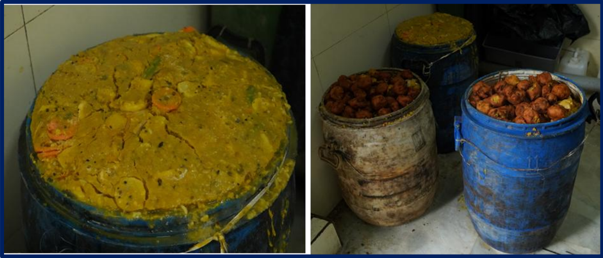
Fig. 6 Collection of food waste