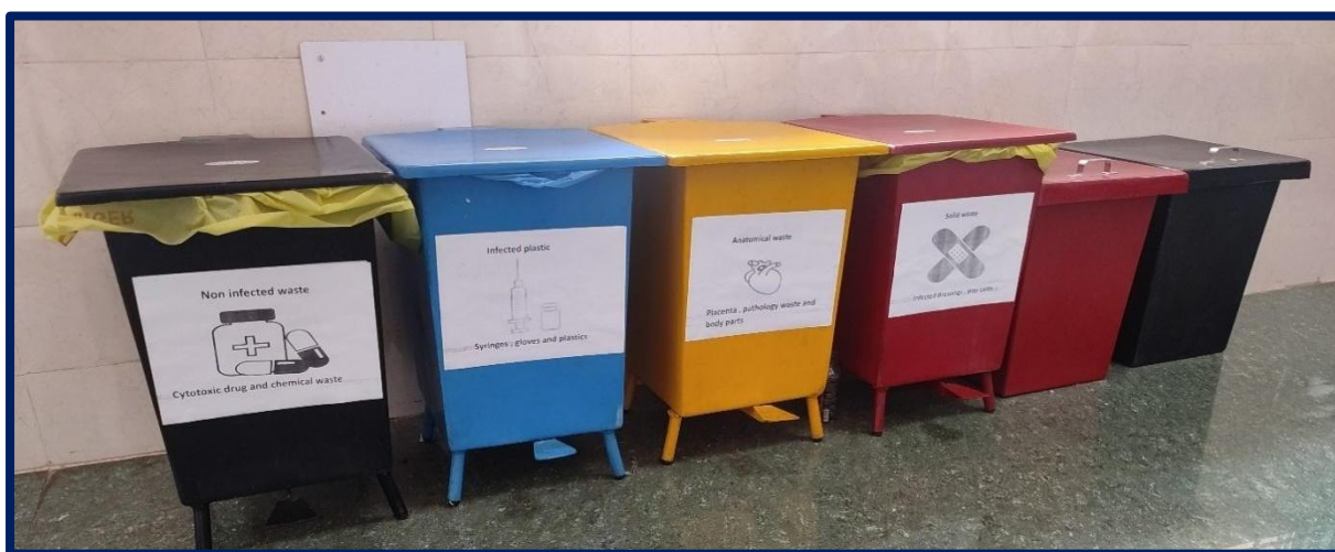
Fig. 3 Color-coded bins for the collection of biomedical waste