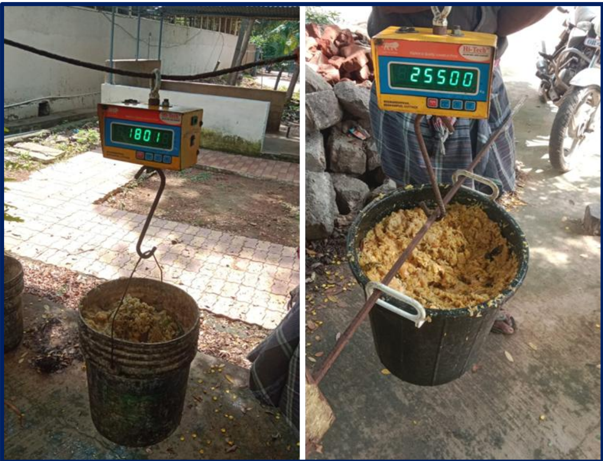
Fig. 7 Measurement of food waste