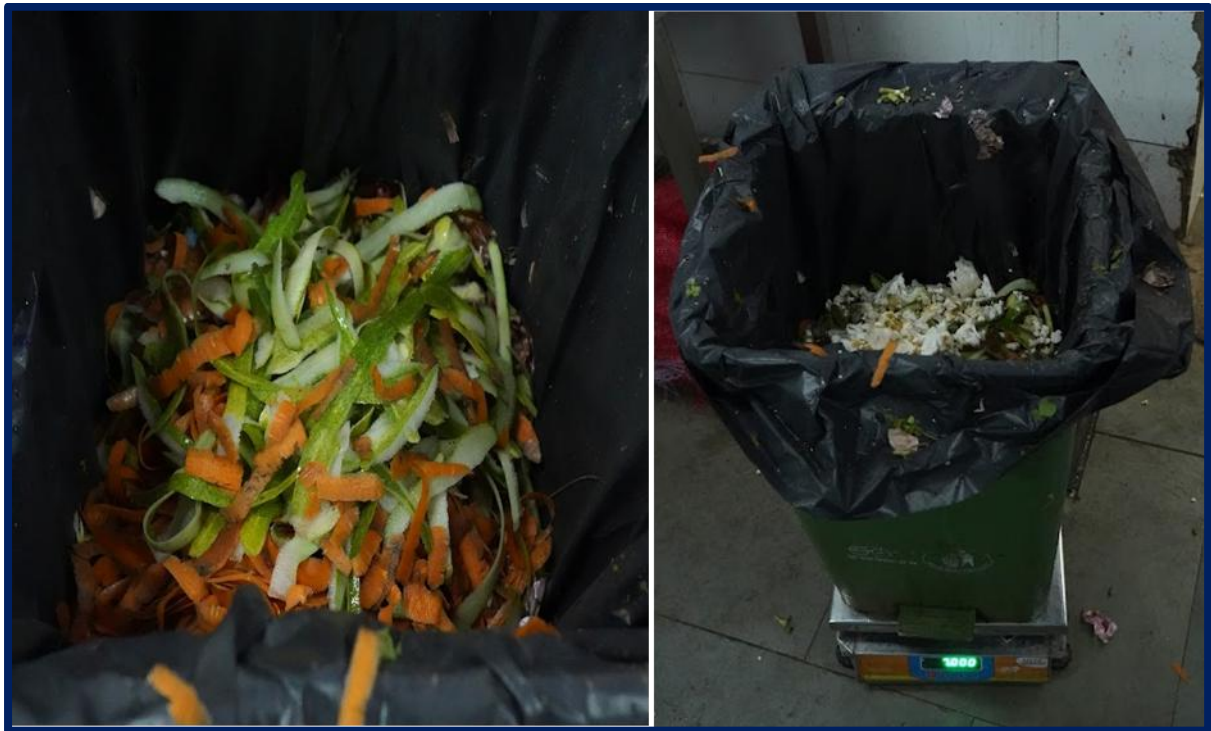
Fig. 8 Collection of vegetable waste