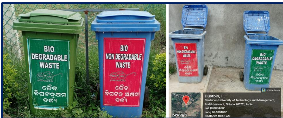
Fig. 2 Color-coded bins set up across the campus for the collection of biodegradable and non-biodegradable waste