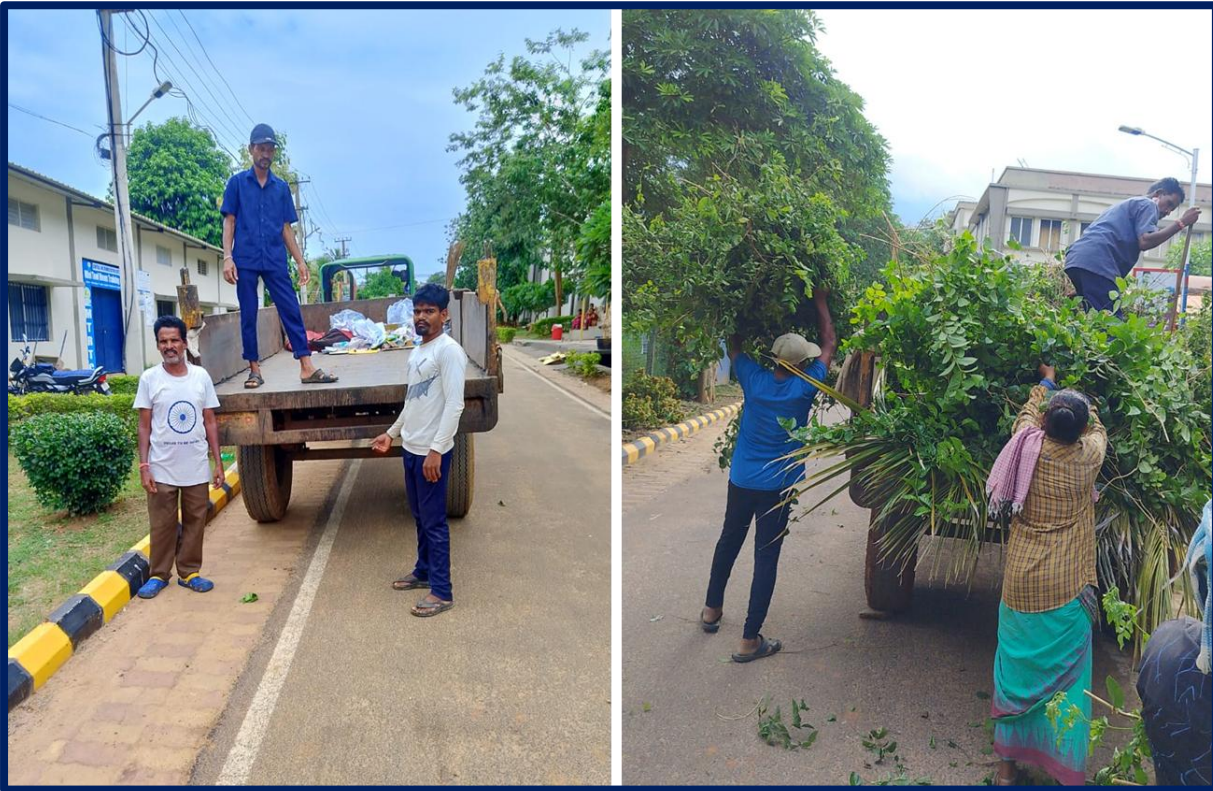
Fig.14 Collection of biodegradable and non-biodegradable wastes