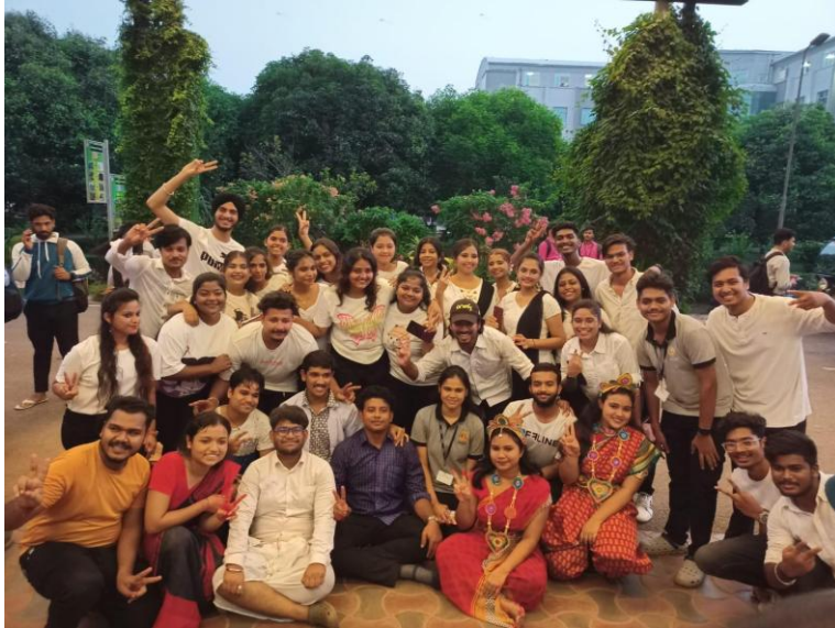
Fig 3: Street Play & Flash Mob on World Mental Health Day (10 October 2024), organized by the Drama & Dance Club of Centurion University. The performance highlighted the theme “Mental health is a universal human right,” raising awareness, reducing stigma, and promoting collective well-being through art and advocacy.