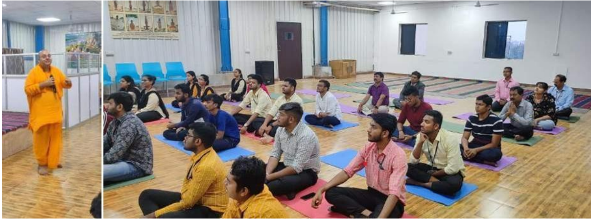
Fig 2: Embracing mindfulness and inner strength — students participating in a guided yoga and meditation session to enhance focus, balance, and well-being.”