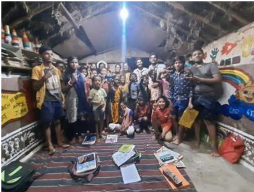
Fig 4: Building hope through learning and togetherness — a community initiative bringing children and youth together in a safe, creative space for education and well-being.”

Centurion University’s mental health strategy is closely integrated with its overall mission of community well-being and health innovation. Mental health initiatives are embedded in its SDG 3 commitments , linking academic training with outreach, inclusivity, and applied research. This ensures that mental health is not treated as an isolated issue but as an integral part of a holistic model of education and social responsibility .