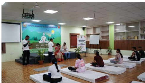
Fig 4: Yoga Session for staff members for Health & Well-being