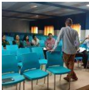
Fig 2: Awareness Campaign conducted for staff and faculty of mental health and well being