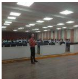
Fig 3: Workshop organized for mental health