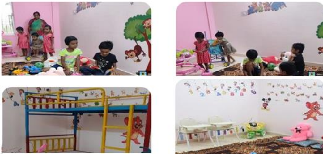
Fig 1: Crèche Facilities at CUTM

Centurion University maintains a family-friendly institutional policy that prioritizes inclusive childcare support for students and employees. The university operates dedicated creche and breastfeeding facilities at its Paralakhemundi and Bhubaneswar campuses, enabling recent mothers to attend university courses and resume academic or professional responsibilities without disruption.