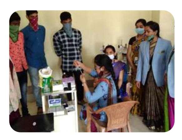
Health camp in collaboration with Centurion University and Viswass Nursing College

A health checkup program was also conducted by the Community Diagnostic Center, Centurion University at Viswass Nursing College, Khordha. The event witness's active participation of people from nearby localities to avail the free service.