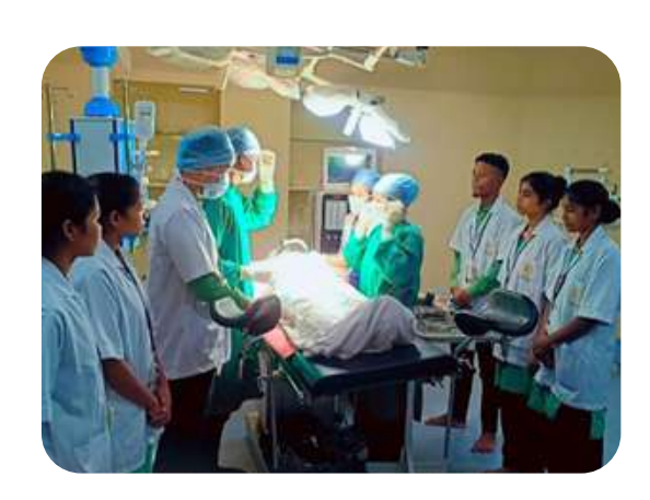
Training of students in Operation Theatre sector as a collaboration between Centurion University and NMDC

Centurion University has also collaborated with LTIMindtree to train 29 students from different underserved localities of Odisha in Phlebotomy technique.