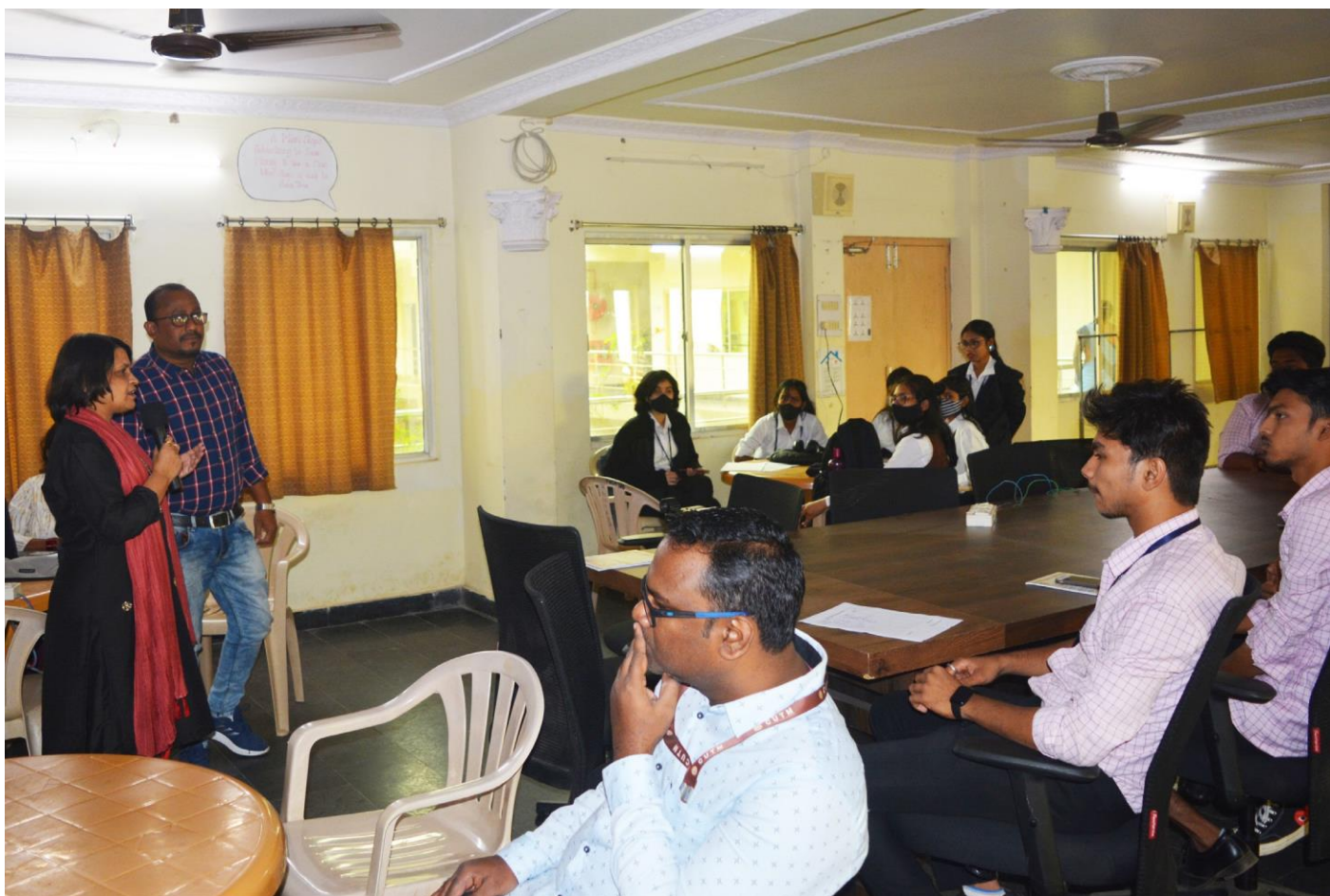
(Describing the purpose of the workshop)