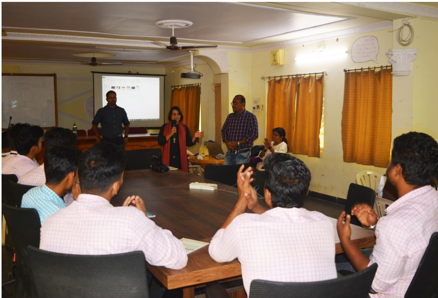
(Introducing the Organizer)