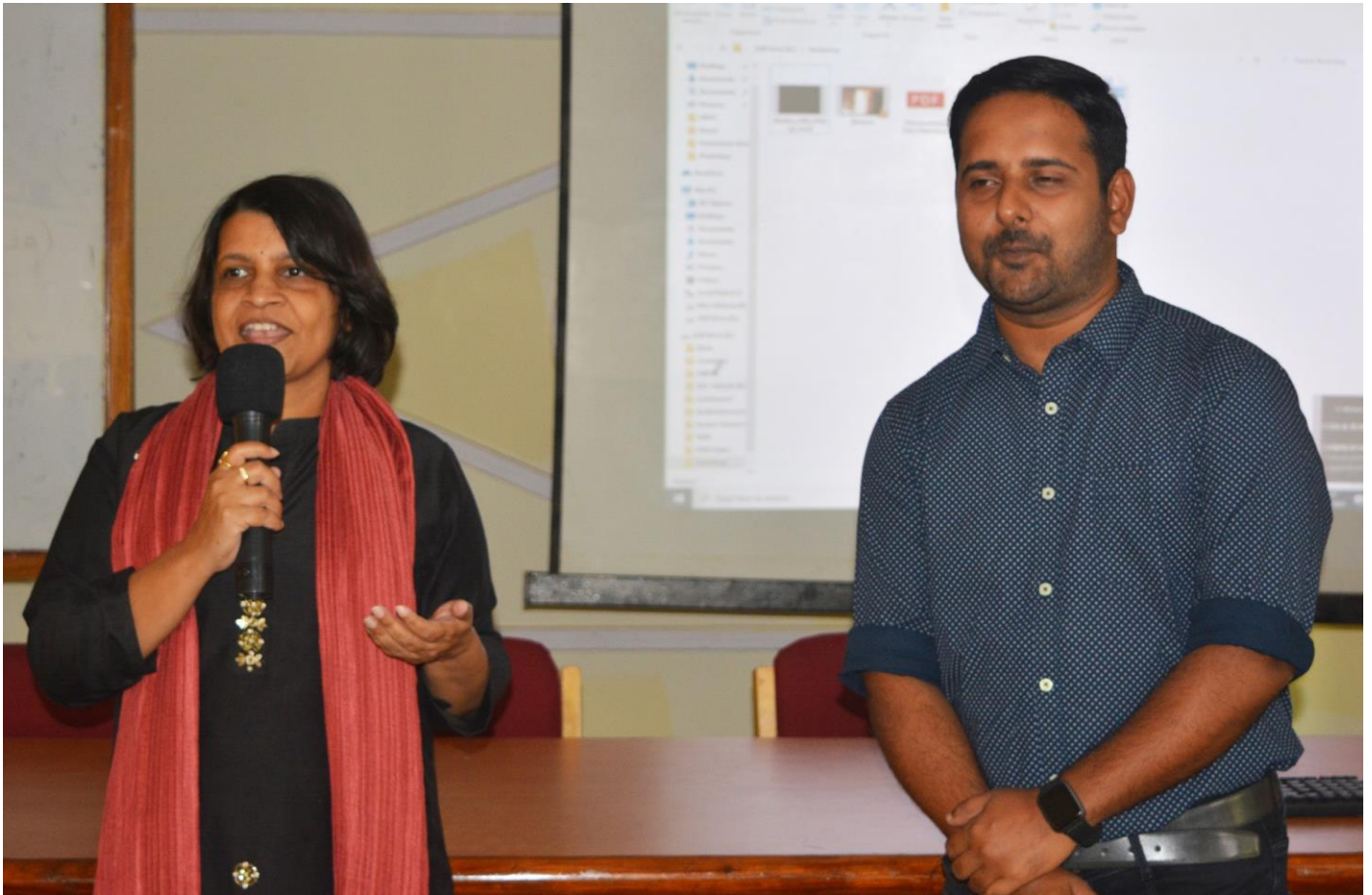
(Introducing the Resource Person)