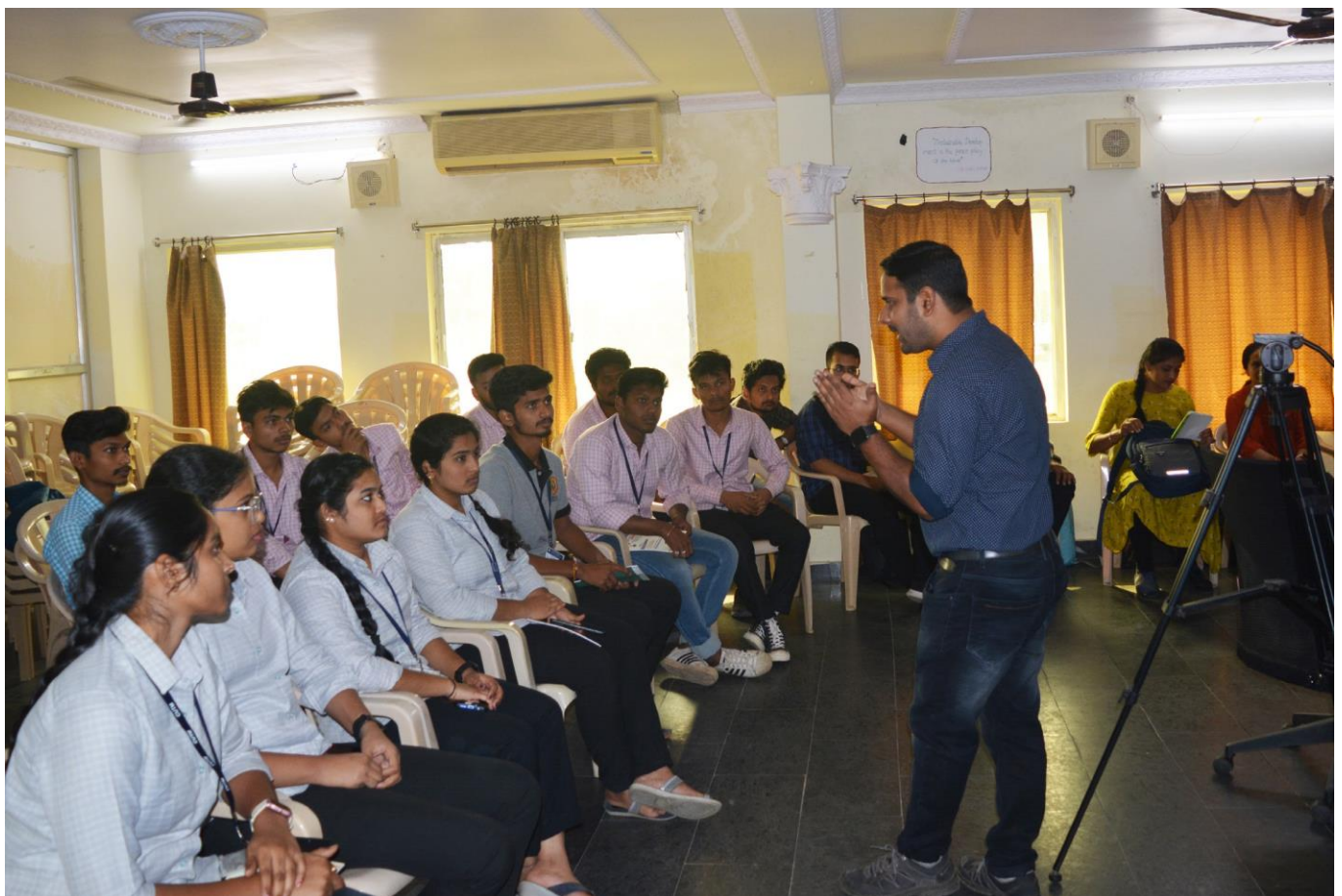
(Explain the Different Angle Shots)