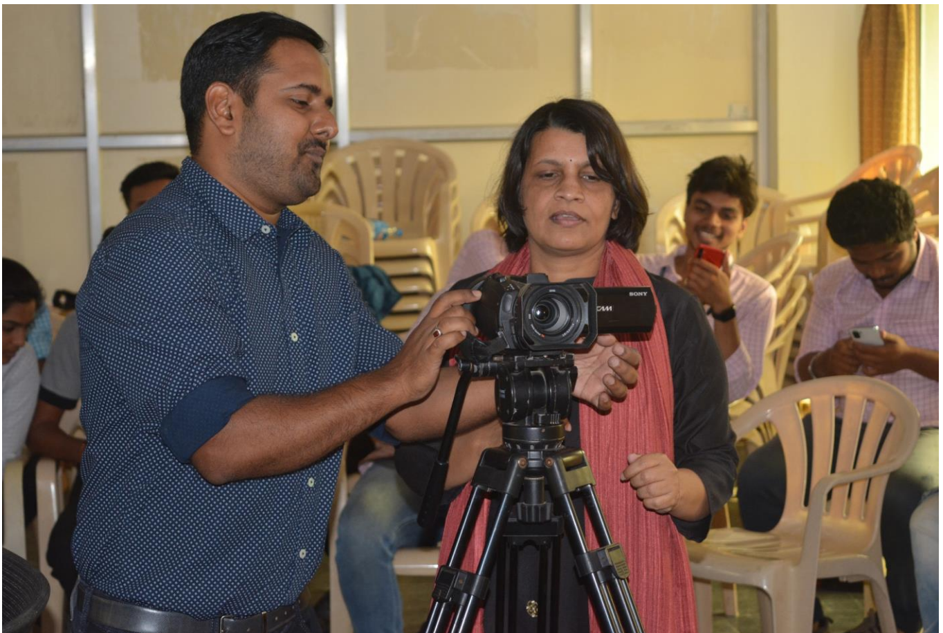
(Session on Camera Operation)