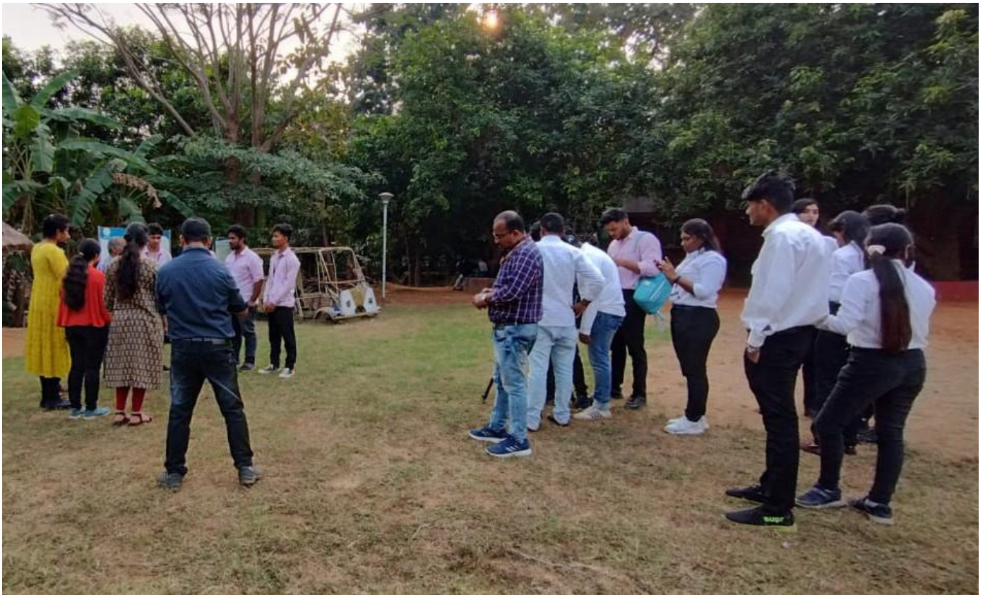
(Explain the location)