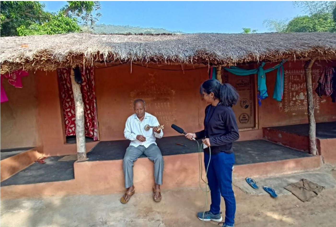
(Explain the location)