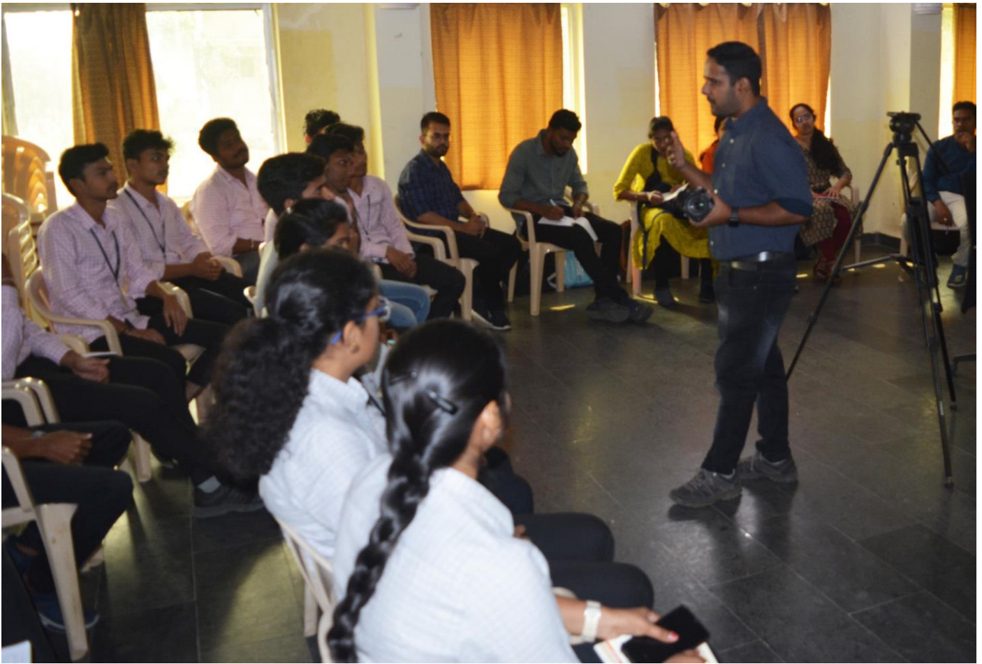
(Explain the Different Angle Shots)