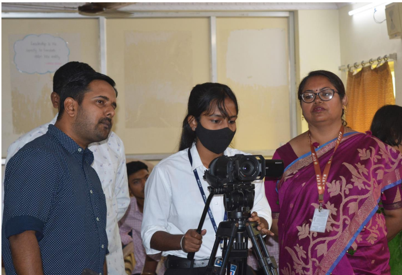
(Training on how to Handle the Video Camera)