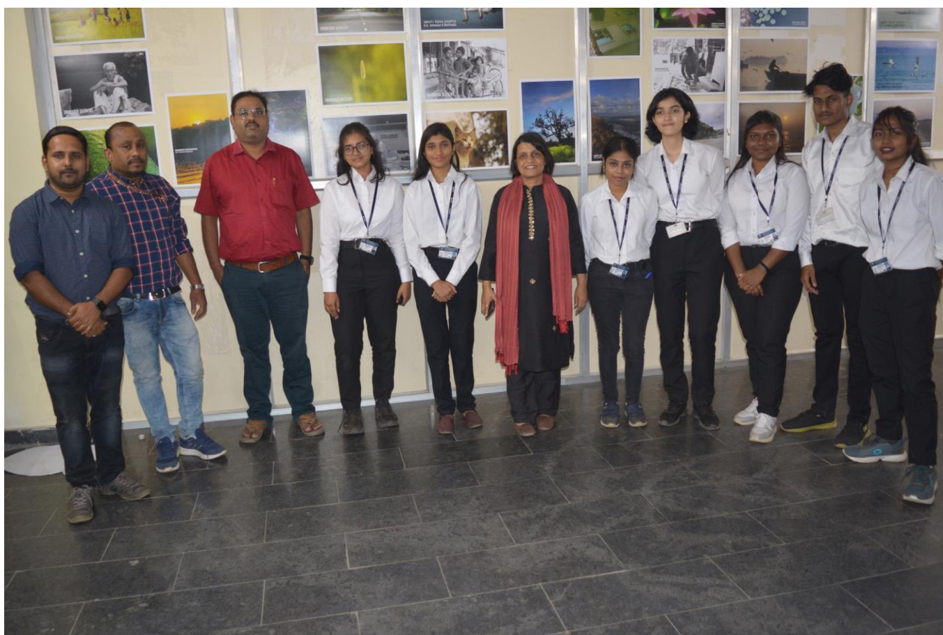
(Exhibition Participant and Faculty)