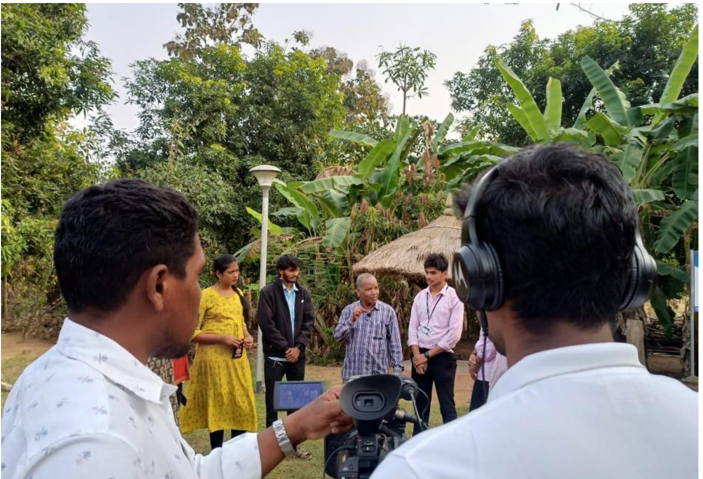
(Video Shooting of Tribal Village)