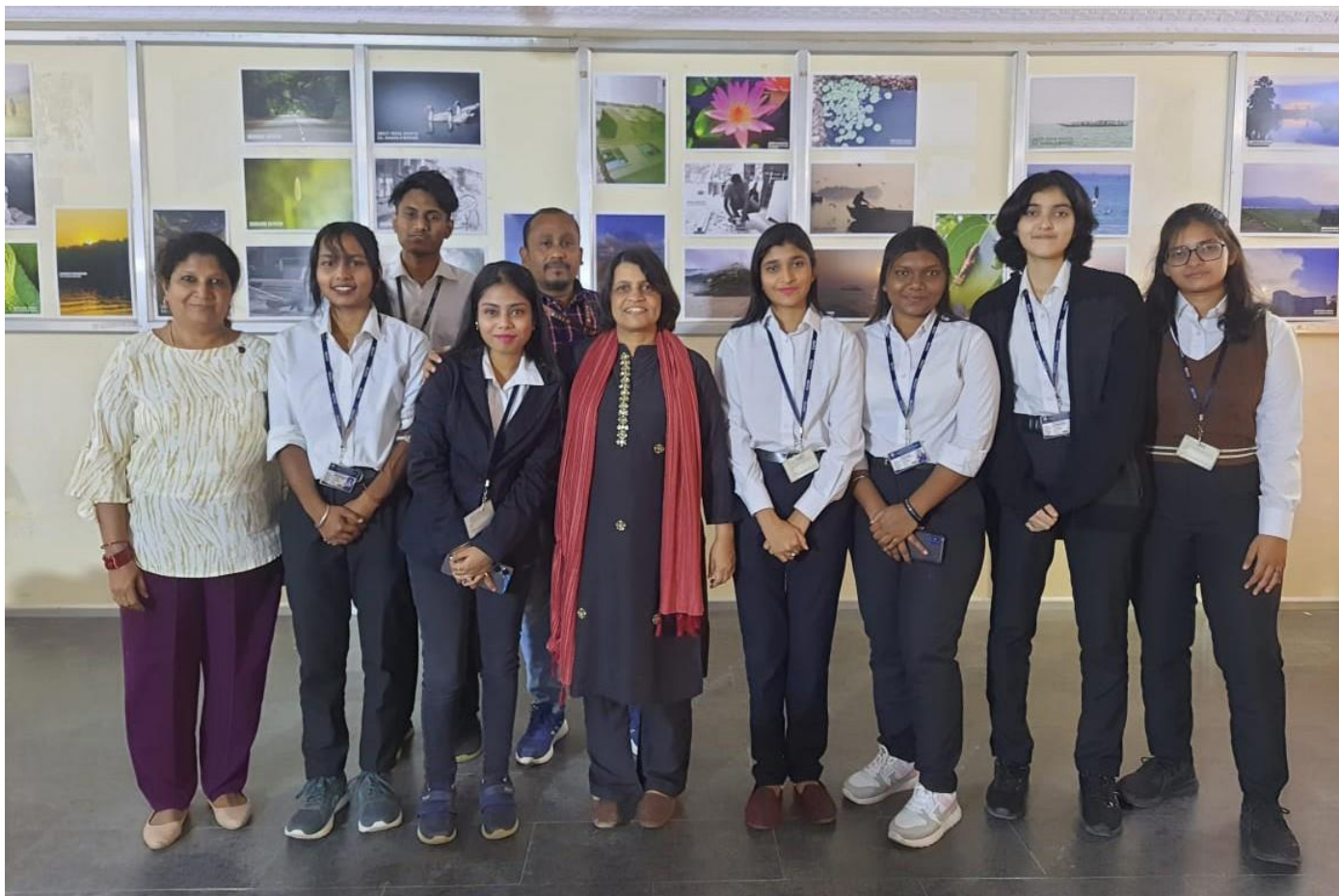
(Exhibition Participant and Faculty)