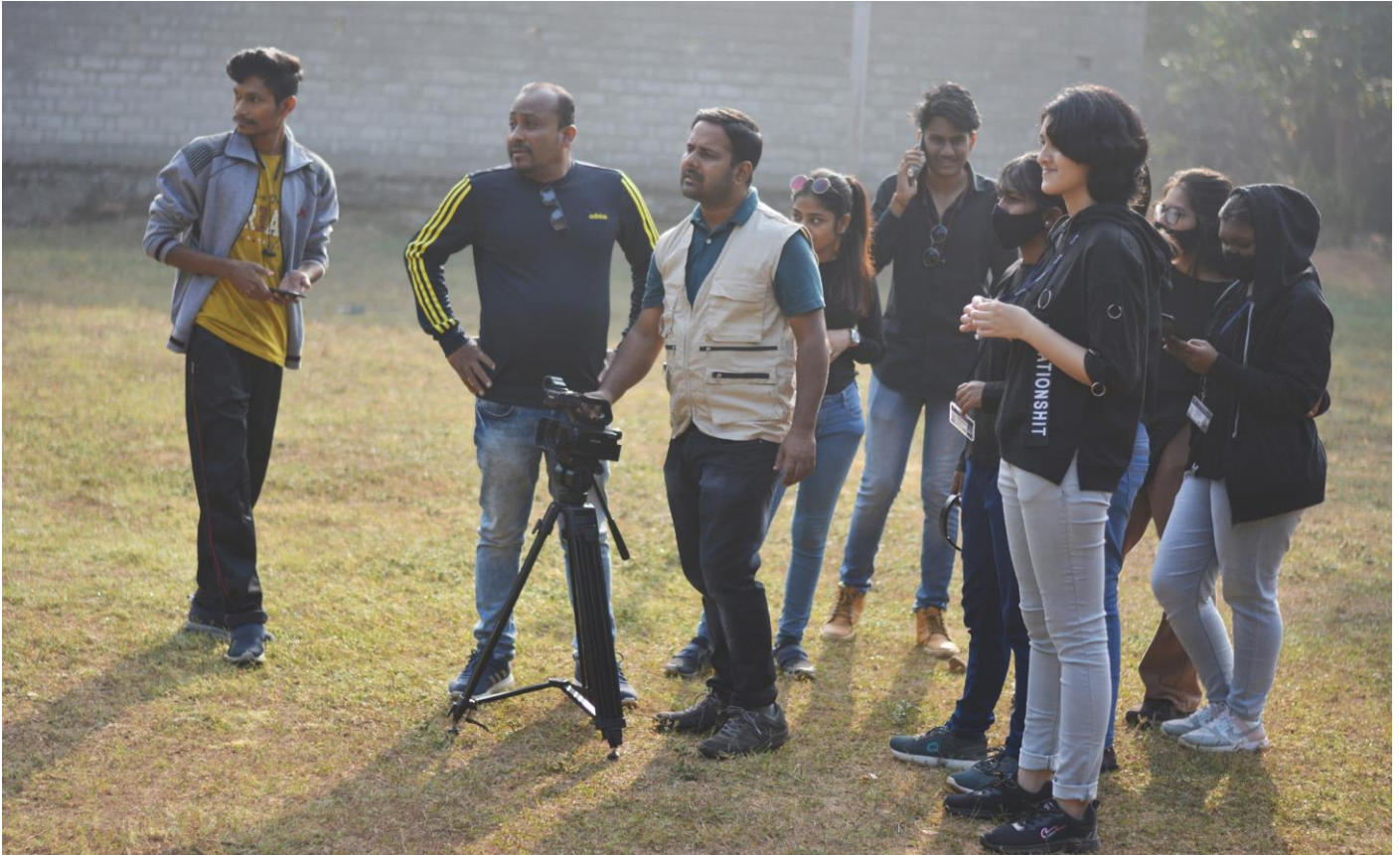
(Video Shooting of Tribal Village)