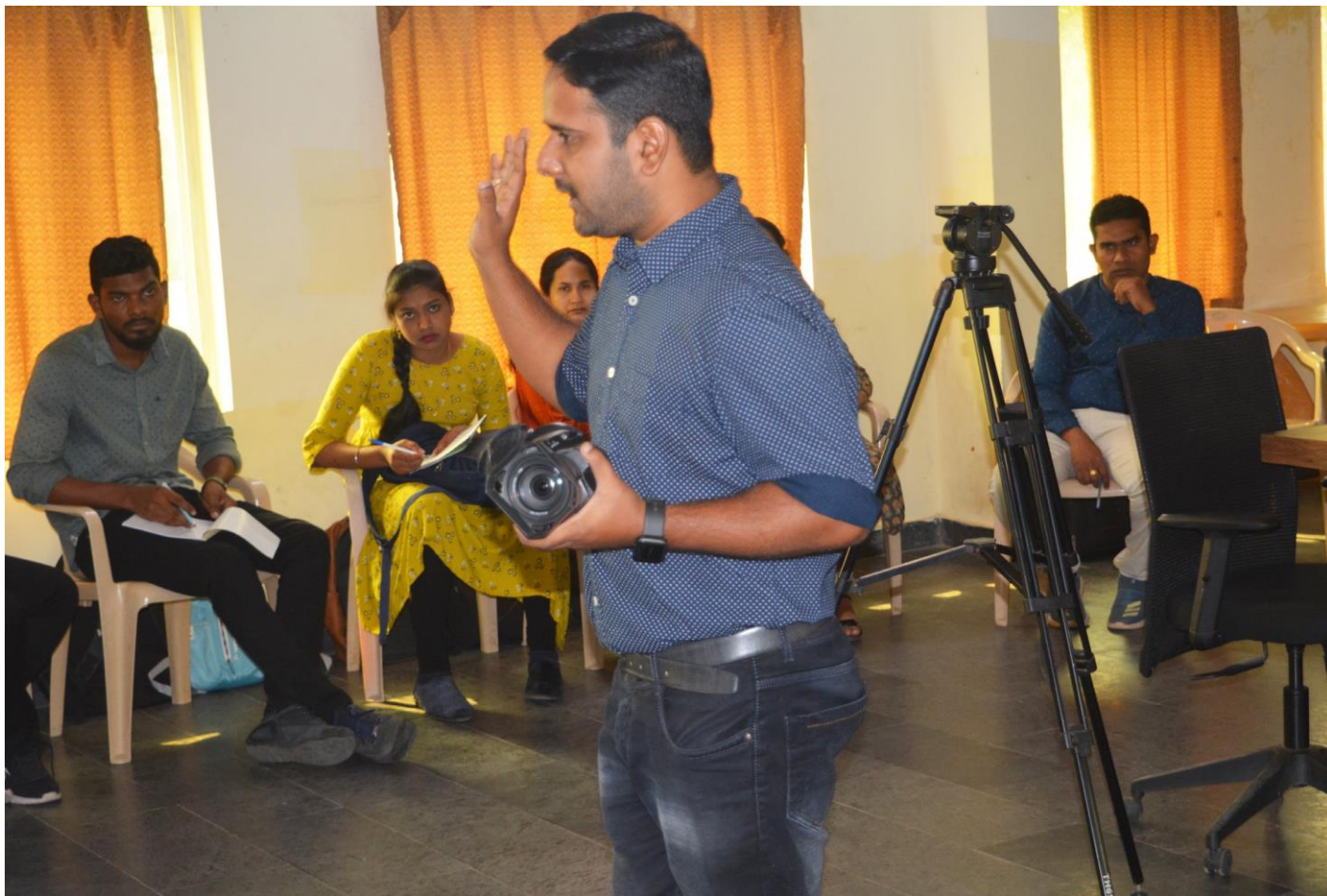
(Explain the different Angle Shots)