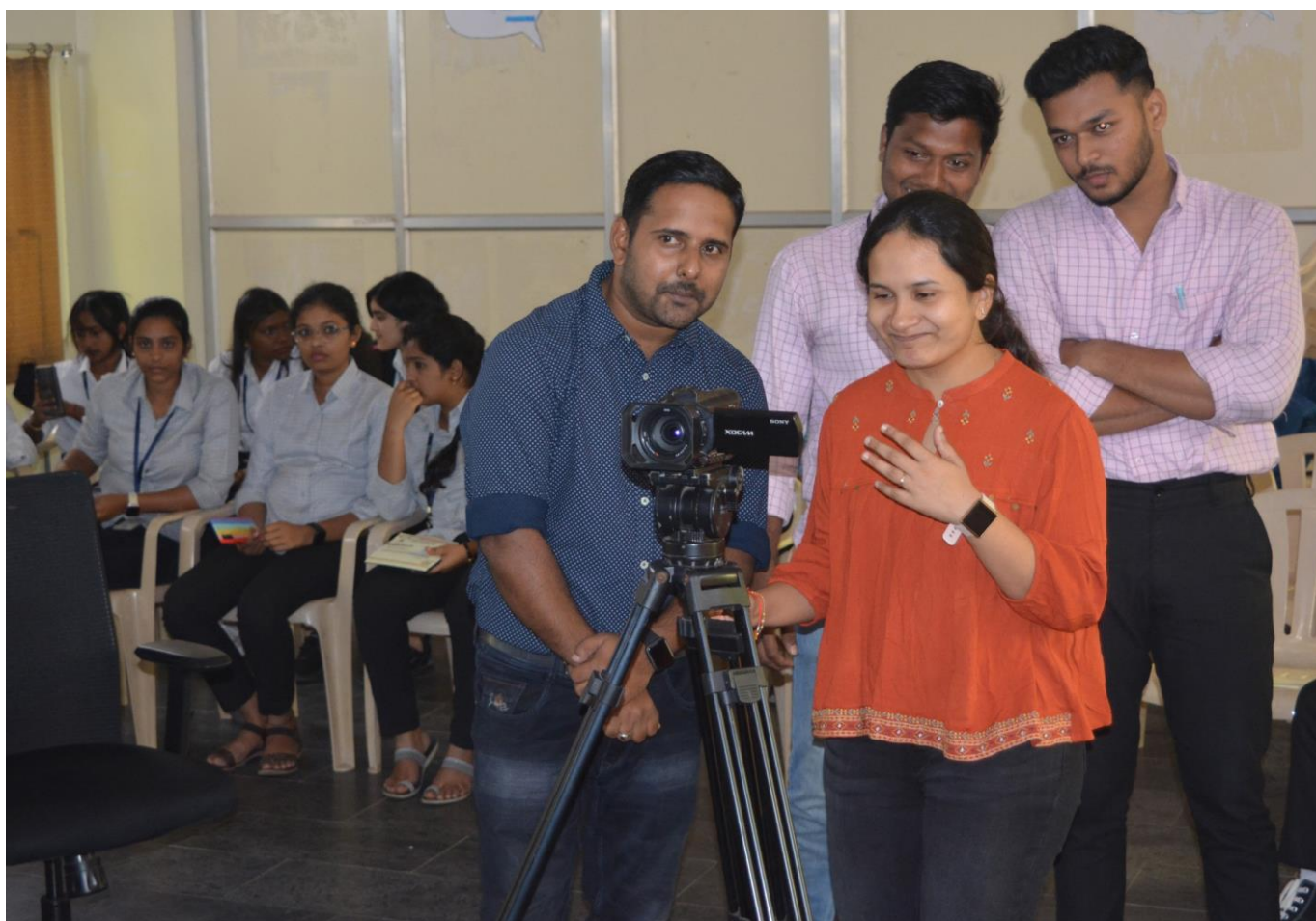
(Session on Camera Operation)