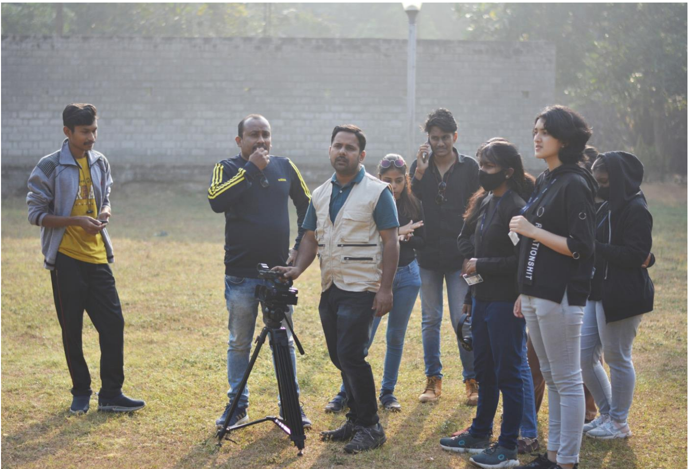
(Video Shooting of Tribal Village)