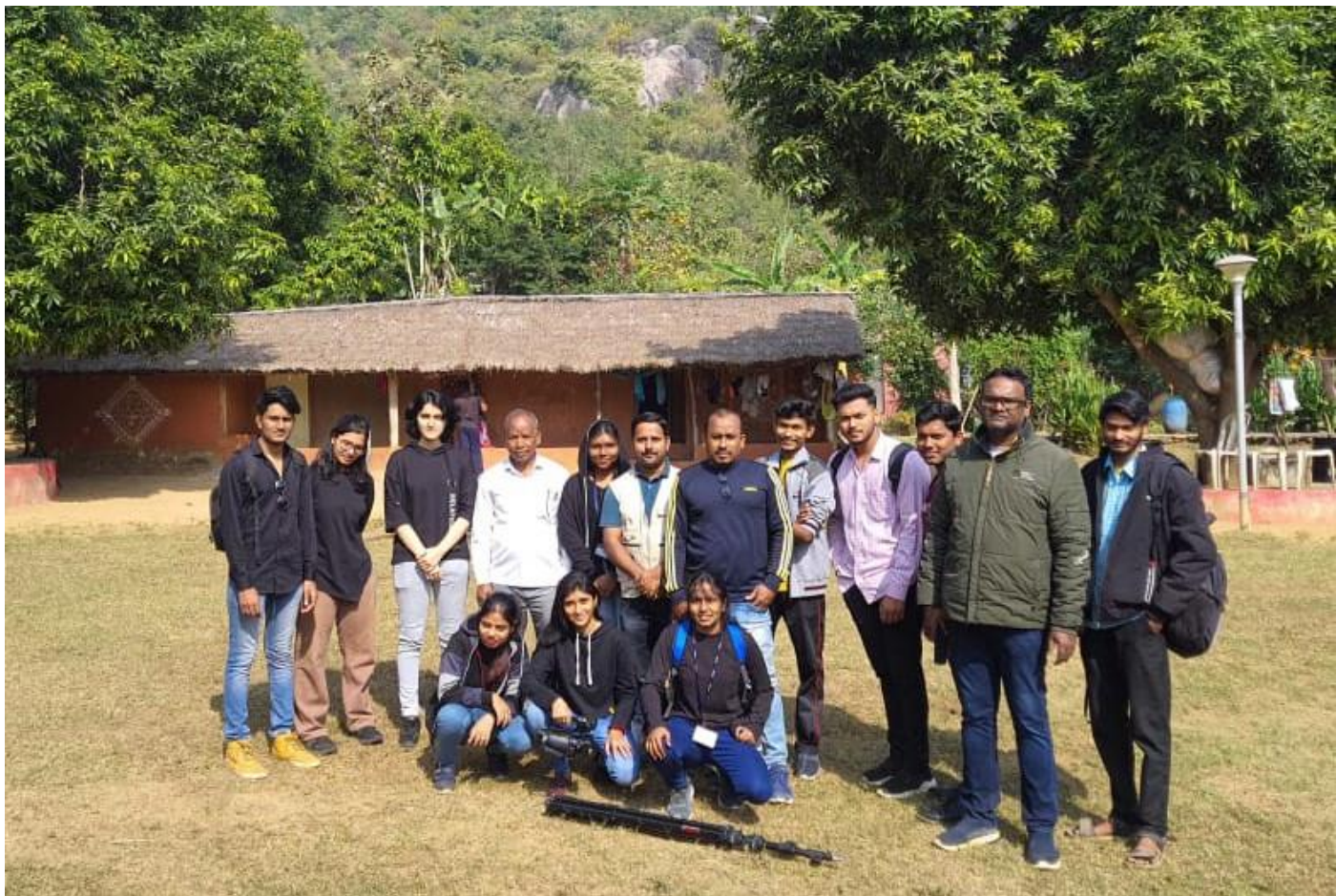
(Group Activity in Tribal Village)