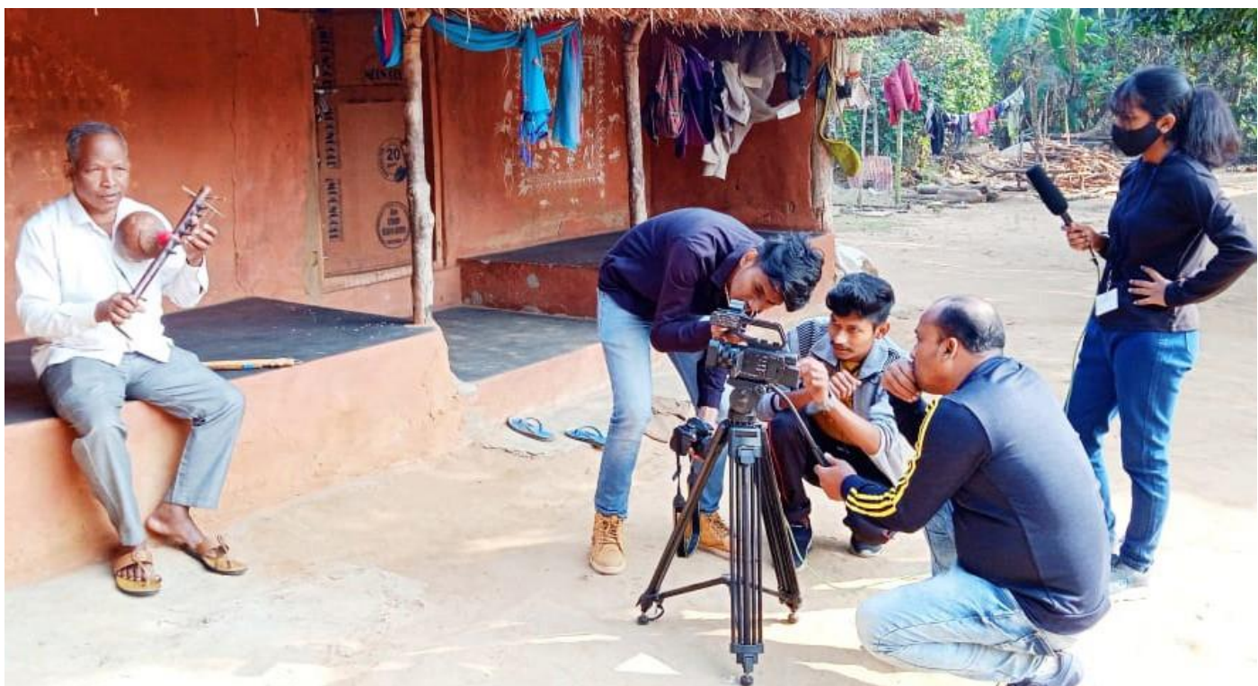
(Video Shooting of Tribal Village)