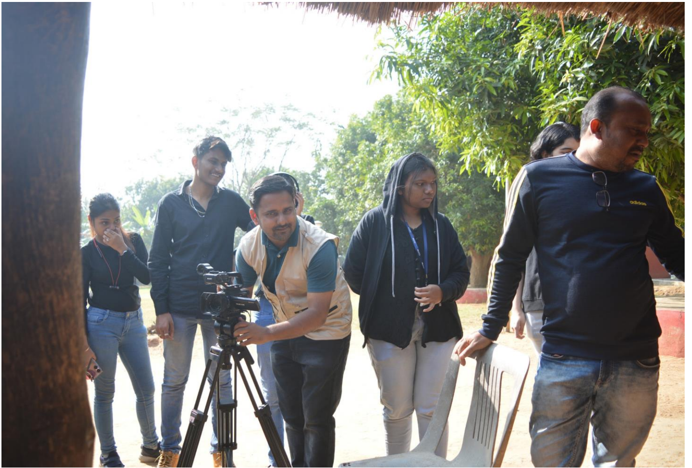
(Video Shooting of Tribal Village)