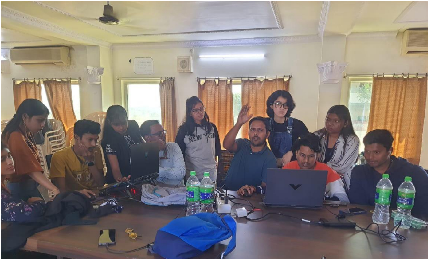
(A session on Editing)