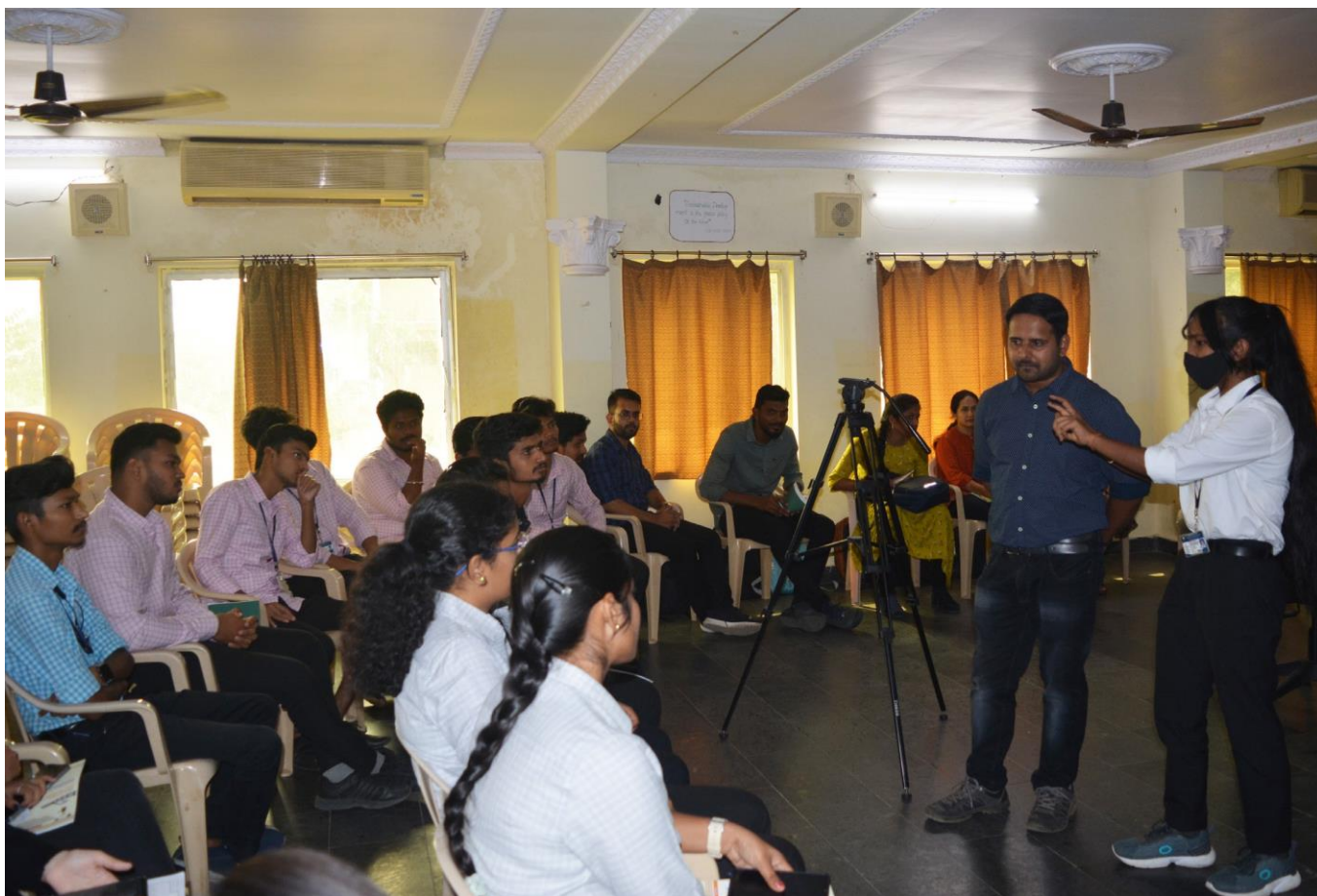
(Explain the Different Angle Shots)