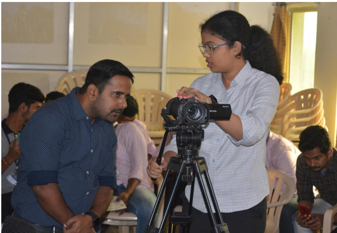
(Describe the Camera Angles)