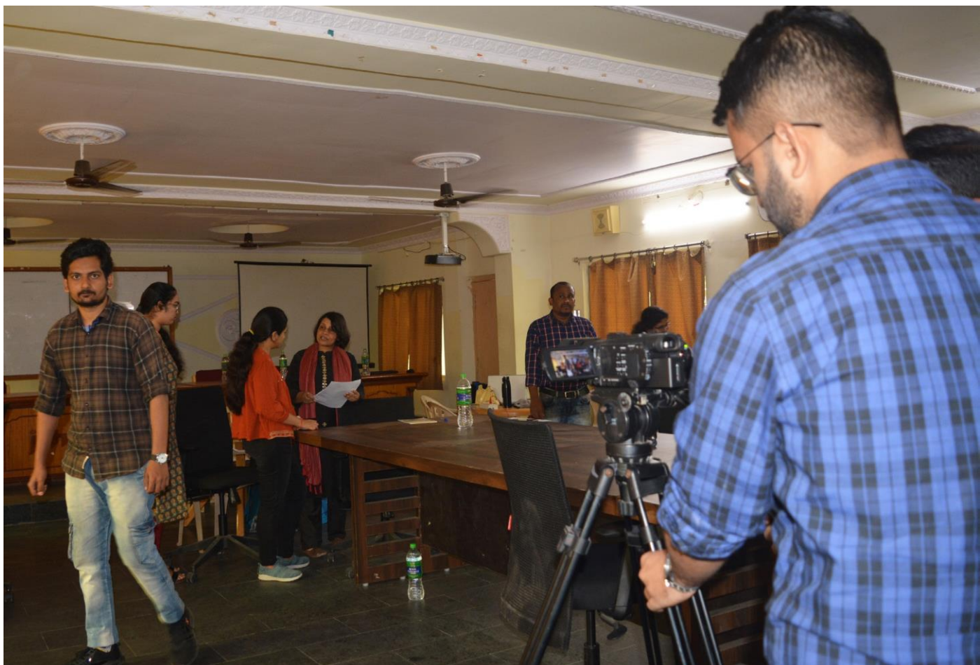
(Session on Camera Operation)