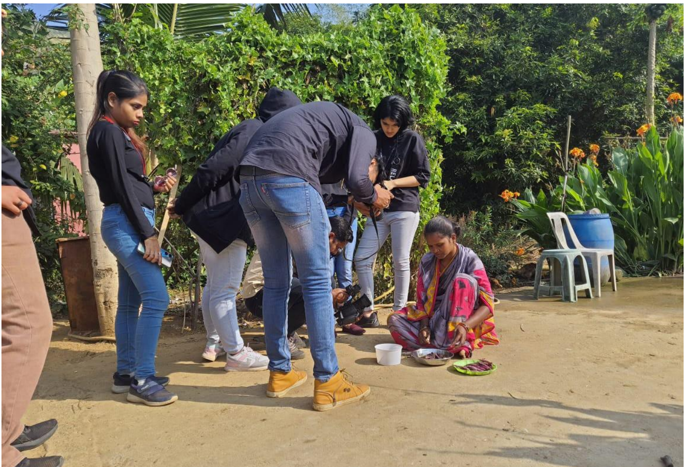
(Video Shooting of Tribal Village)