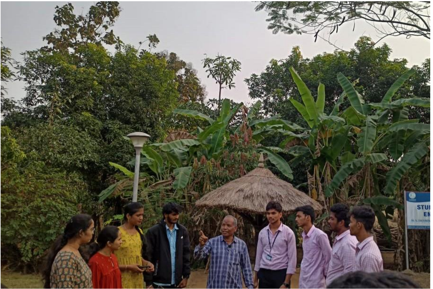
(Explain the location)