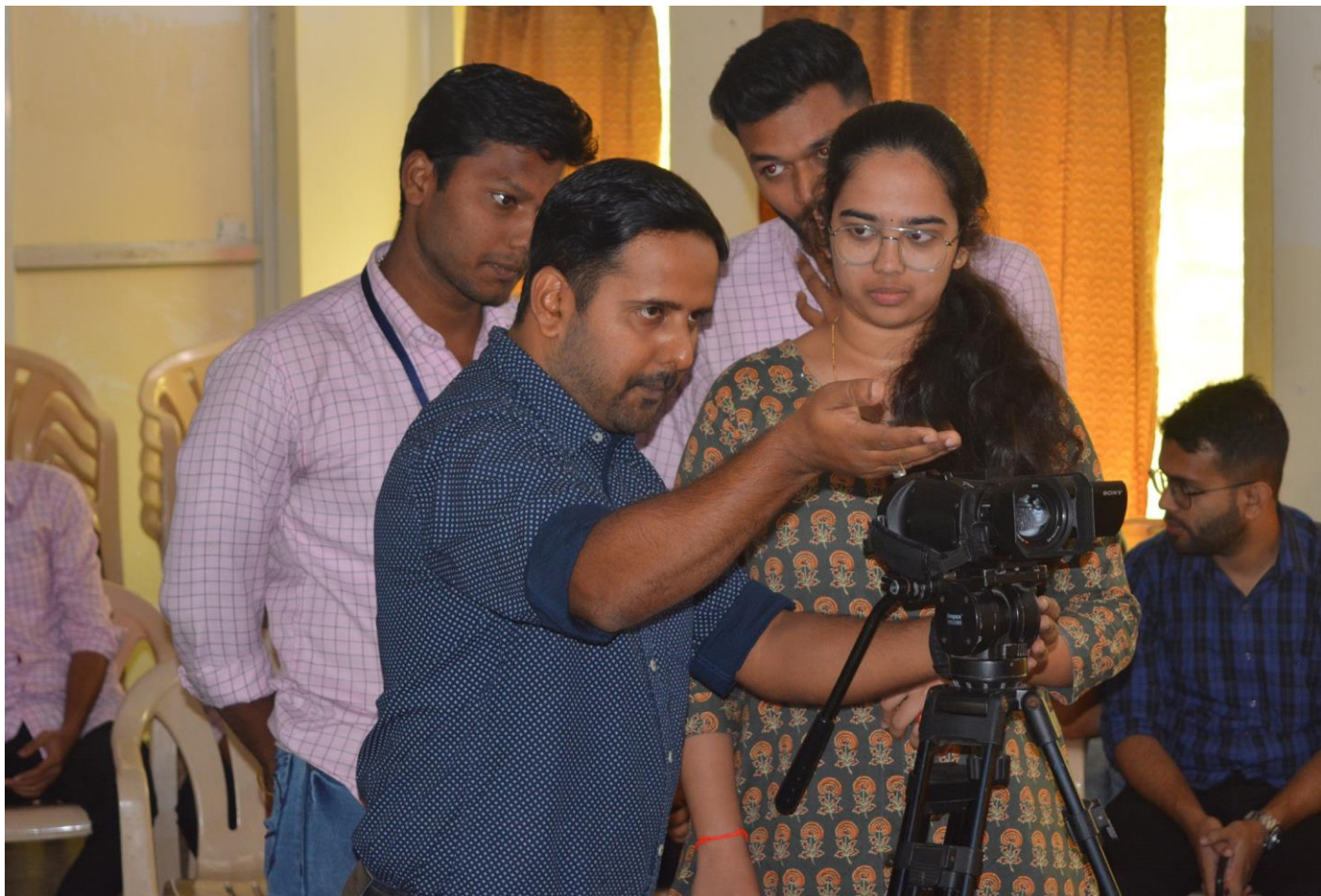
(Describe the Camera Angles)