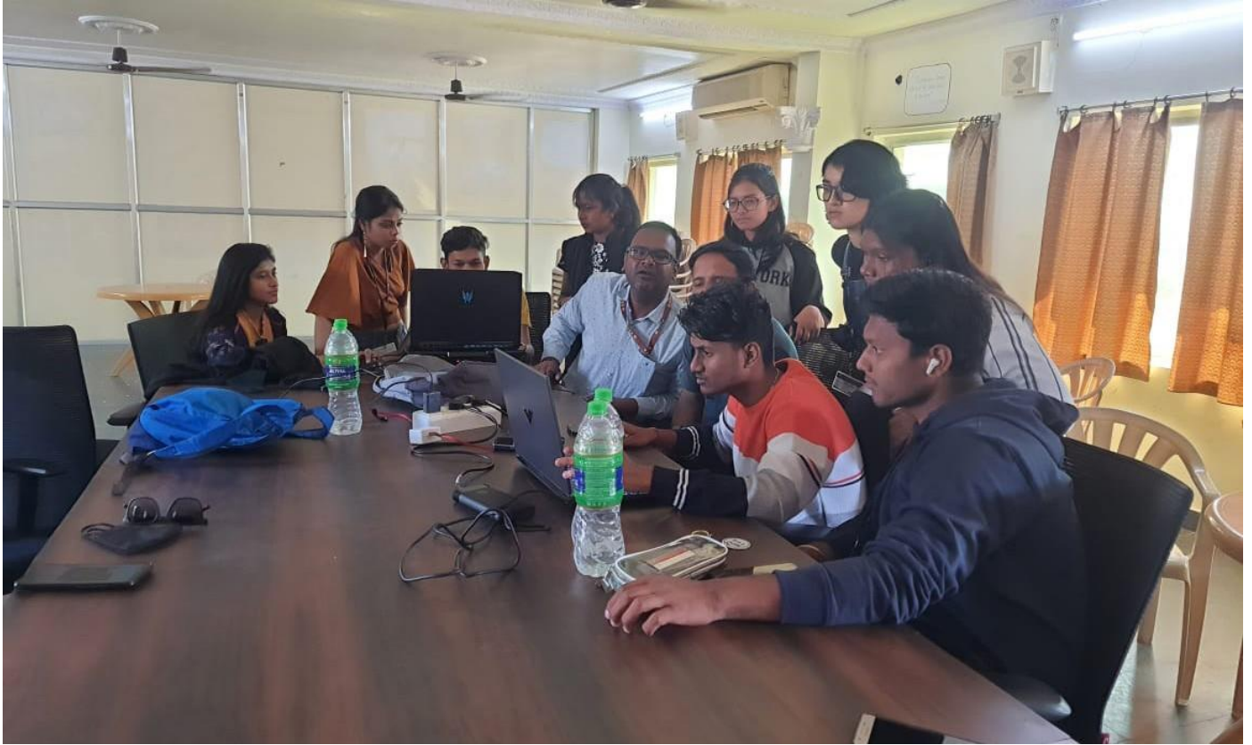
(A session on Editing)