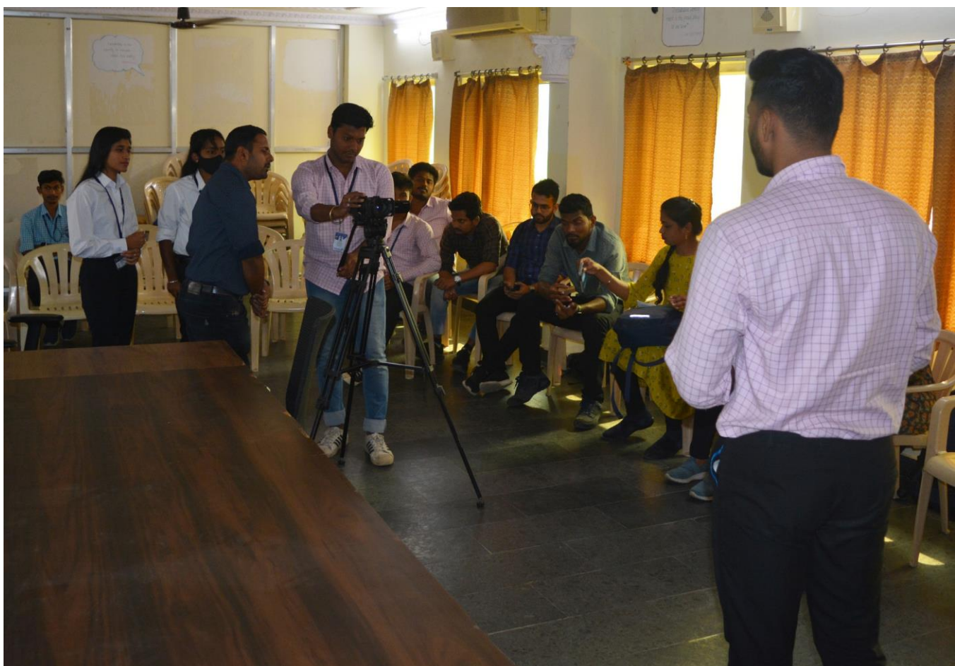
(Session on Camera Operation)