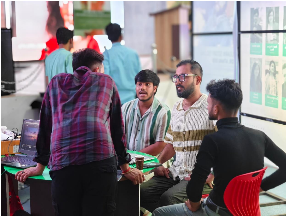
Resource Person reviewing learners interest and boosting critical thinking on 6 th of April, 2024