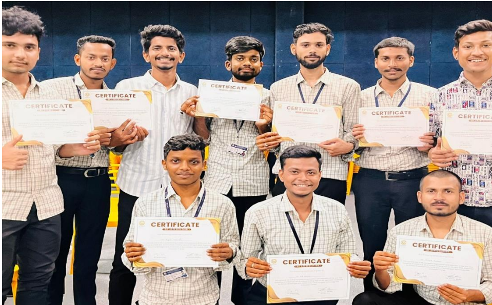
Learners with their certificates after the workshop on 6 th of April, 2024