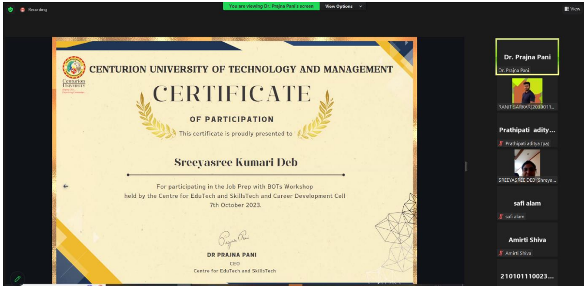
Certificate of Participation awarded to the registered students, 7.10.2023